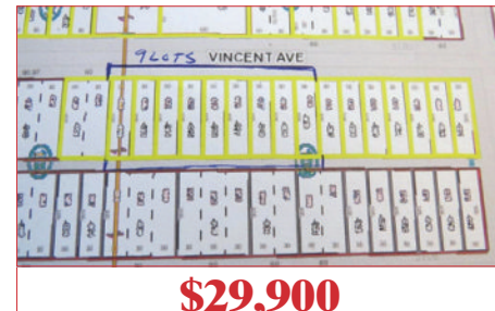
Vincent Ave Lorain 9 lots available