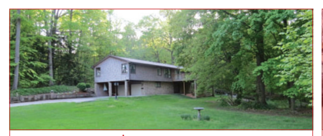
$369,900 9515 Angling Rd, Wakeman