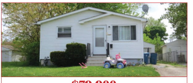
$79,900 1247 W 17th St, Lorain