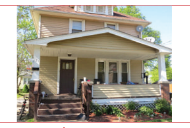
$70,000 171 Bath St, Elyria