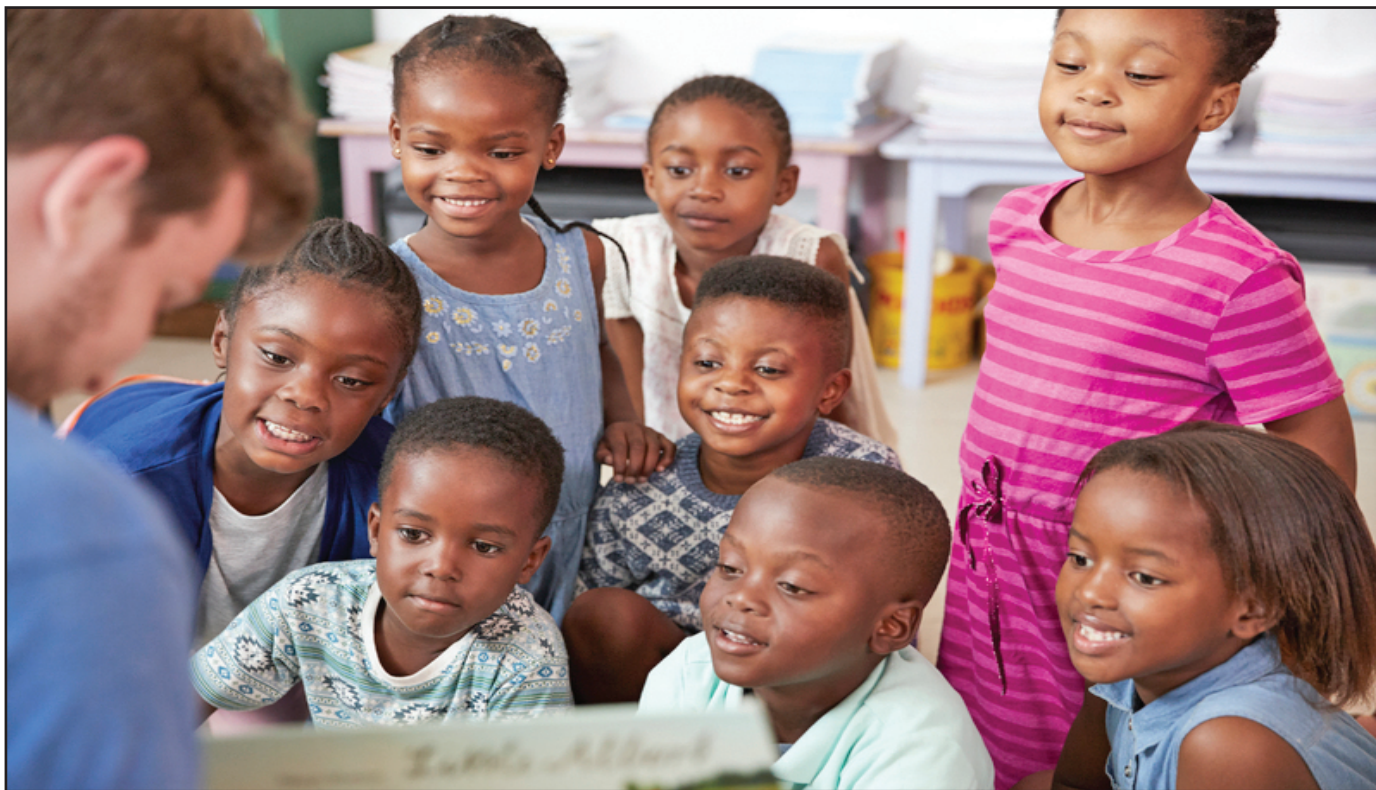
The Boys & Girls of Metropolitan Baltimore-Brooklyn Club is among three Lift Zones to be revitalized and receive a makeover through a partnership between Comcast and HGTV. Lift Zones are locations within community centers and recreation centers across the country where students and families can get high-speed Internet access for distance learning, applying for jobs or staying in touch with family and friends.

The Lift Zones initiative complements Comcast's Internet Essentials program, which, since 2011, has connected a cumulative total of more than 10 million people in need to the Internet at home. By also providing community centers with free WiFi service, more students, seniors, veterans, and others have access to the Internet for education, participating in digital skills training, applying for jobs, and staying in touch with friends and family who have been forced to socially distance due to the pandemic.