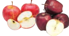
Red Delicious Or Gala Apples Premium