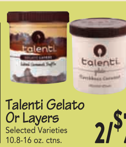
Talenti Gelato Or Layers Selected Varieties 10.8-16 oz. cnts.