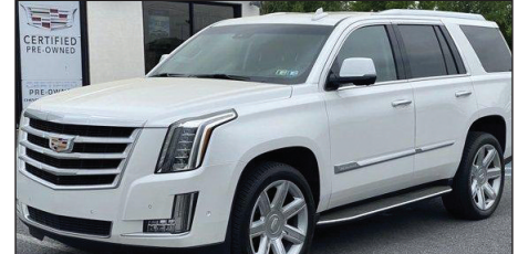
2017 Cadillac Escalade U588T, Reg Ext., Lux Model, 30K Miles