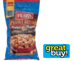
Herr's Peanut Butter Filled Pretzel Nuggets 28 oz. bag