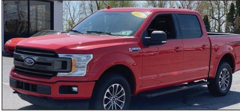
2018 Ford F150 XLT U5867, 4x4, Turbo, Only 23K Miles