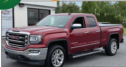
2018 GMC Sierra 1500 SLT G21343A, 4x4, 8K Miles