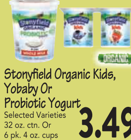
Stonyfield Organic Kids, Yobaby Or Probiotic Yogurt Selected Varieties 32 oz. cnt. Or 6 pk. 4 oz. cups