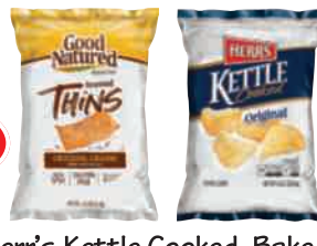
Herr's Kettle Cooked, Baked Or Good Natured Potato Chips Selected Varieties - 7-8 oz. bags