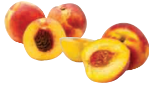
Peaches Or Nectarines Fresh