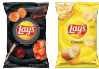
Lay's XL Potato Chips Selected Varieties - 5-8 oz. bags