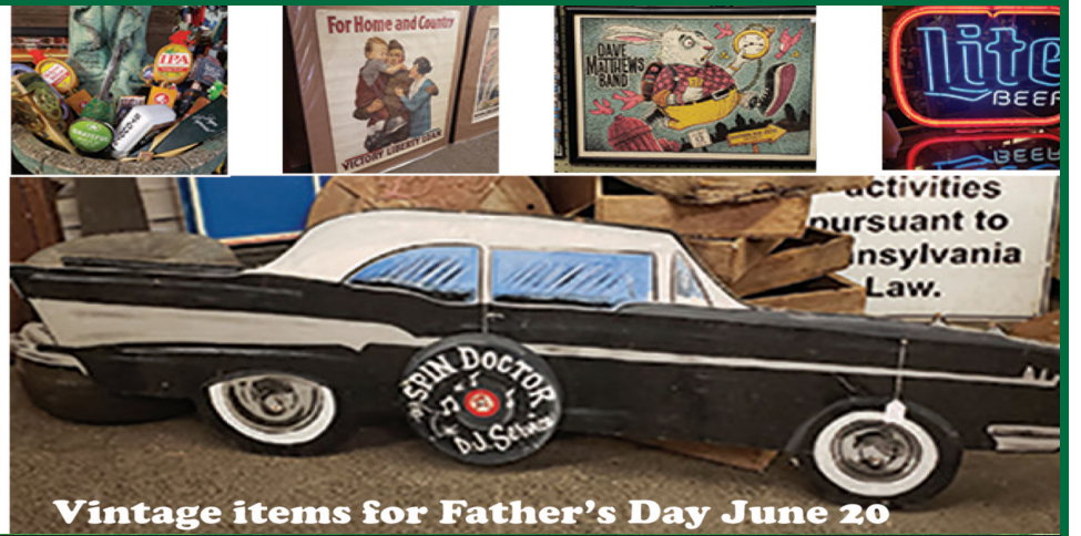
Vintage items for Father's Day June 20

Farmers Market and Kutztown Vintage Open Fridays 10 to 6. Saturday 8 to 4 - Farmers Market & Antiques Vintage Market.