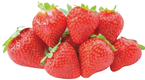
California Strawberries Red Ripe - 1 lb. cnts.