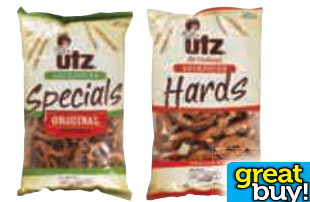
Utz Pretzels Selected Varieties 6-16 oz. bags