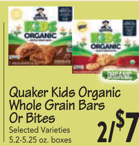
Quaker Kids Organic Whole Grain Bars Or Bites Selected Varieties 5.2-5.25 oz. boxes