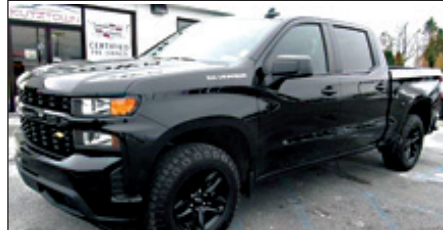
2019 Chevy Silverado Custom Crew U5821, 28L Miles