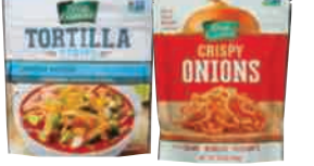
Fresh Gourmet Crispy Salad Toppers Selected Varieties - 3.5 oz. bag