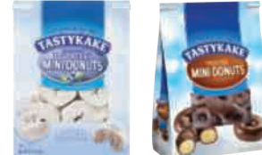
Tastykake Mini Donuts Selected Varieties 9.5-11.5 oz. bags