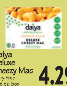
Daiya Deluxe Cheesy Mac Dairy Free 10.6 oz. box