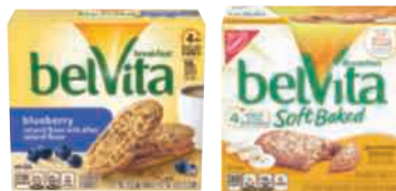
Nabisco Belvita Biscuits Or Sandwiches Selected Varieties 7.04-8.81 oz. boxes