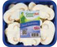
Green Giant Sliced White Mushrooms 8 oz. pkg.