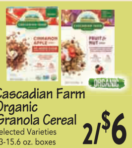
Cascadian Farm Organic Granola Cereal Selected Varieties 13-15.6 oz. boxes