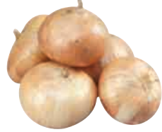
Jumbo Vidalia Onions From Georgia