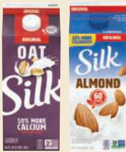
Silk Almond, Cashew Or Oat Milk Selected Varieties 64 oz. cnts.