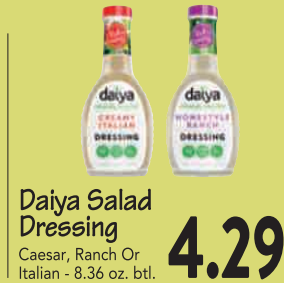
Daiya Salad Dressing Caesar, Ranch Or Italian - 8.36 oz. btl.