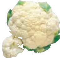
Snow White Cauliflower Fresh - head