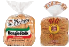
Martin's Rolls Big Marty's Or Hoagie 18-20 oz. pkgs.