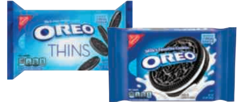
Nabisco Oreo Or Thins Cookies Selected Varieties - 10.1-15.35 oz. pkgs.