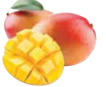
Tropical Ripe Mangoes Sweet & Juicy