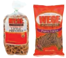
WEGE Of Hanover Pretzels Selected Varieties - 12-15 oz. bags