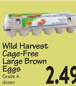
Wild Harvest Cage-Free Large Brown Eggs Grade A dozen