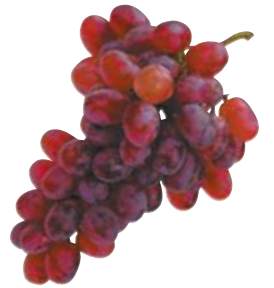
Red Seedless Grapes Juicy