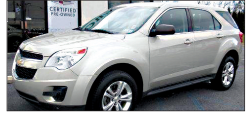
2015 Chevy Equinox U5457B, Low Miles, AWD