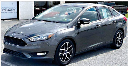
2017 Ford Focus SEL U5870, Low Miles