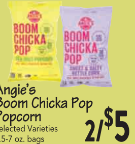
Angie's Boom Chicka Pop Popcorn Selected Varieties 4.5-7 oz. bags