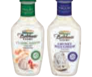
Bolthouse Farms Salad Dressing Selected Varieties - 14 oz. btl.