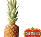
Del Monte Pineapple Tasty