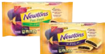
Nabisco Newtons Selected Varieties 10 oz. pkgs.