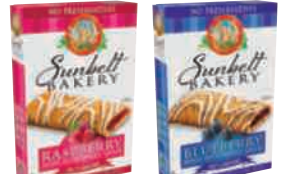
SunBelt Bakery Chewy Granola Or Fruit & Grain Bars Selected Varieties - 8.79-11 oz. pkgs.