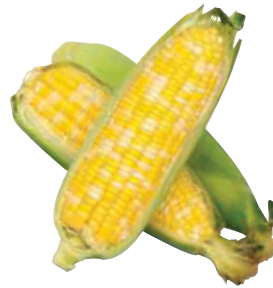
Sweet Corn Bi-Color Or White - Ears