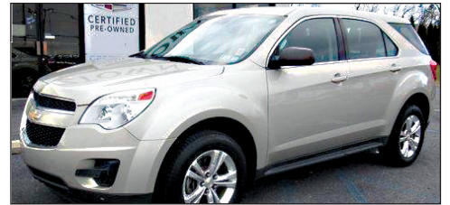
2015 Chevy Equinox U5457B, Low Miles, AWD