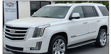
2017 Cadillac Escalade U588T, Reg Ext., Lux Model, 30K Miles