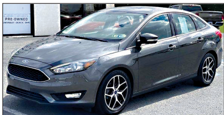
2017 Ford Focus SEL U5870, Low Miles