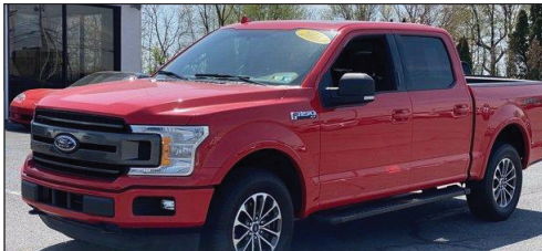
2018 Ford F150 XLT U5867, 4x4, Turbo, Only 23K Miles