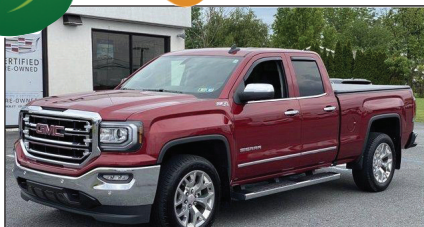
2018 GMC Sierra 1500 SLT G21343A, 4x4, 8K Miles