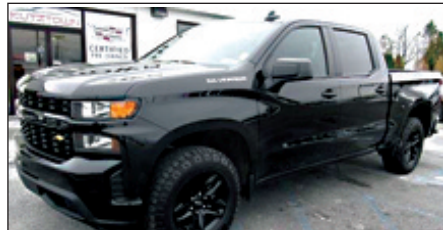
2019 Chevy Silverado Custom Crew U5821, 28L Miles