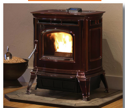
Harman Absolute 43 Pellet Stove

Stop By Our Showrooms To See All Our Stoves.