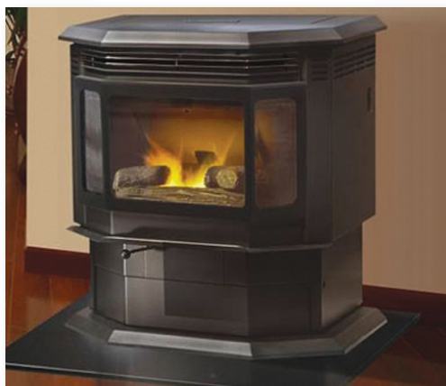
Harman Advance Pellet Stove