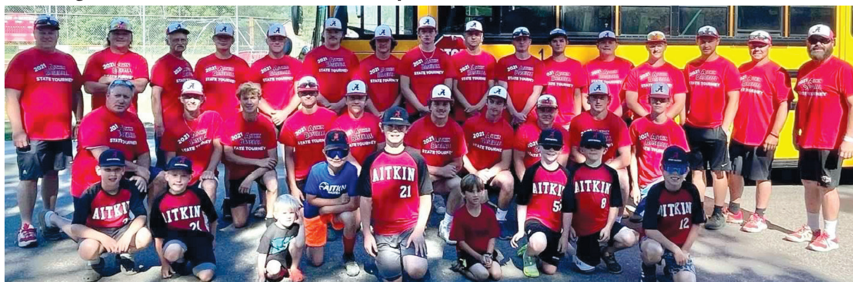
The Aitkin Gobblers high school baseball team is state-bound.