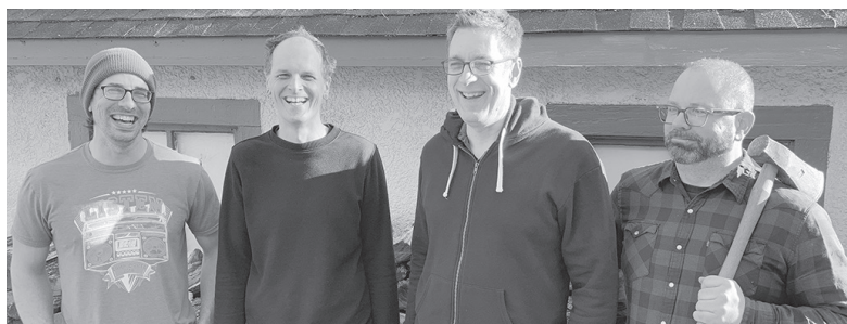
2003UB313 is scheduled to perform on Thursday, June 24 at Crosby Memorial Park on Serpent Lake during Cuyuna Lakes Chamber Music in the Park.

Participants have a chance to win some swag from local businesses each week of the promotion throughout the highway construction season. All participants will also be entered into the grand prize drawing for a gift basket of items from the local businesses. Winners will be notified by the Cuyuna Lakes Chamber and the grand prize winner will be announced once the road work is complete.