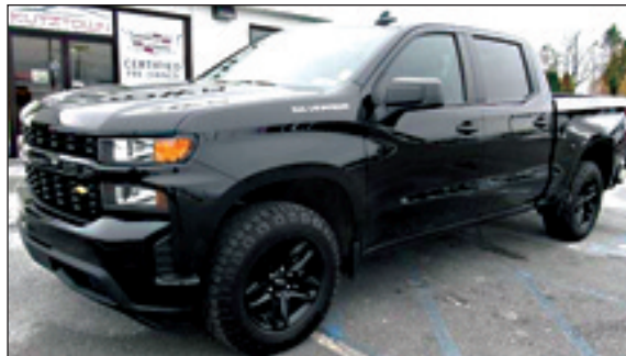
2019 Chevy Silverado Custom Crew U5821, 28L Miles