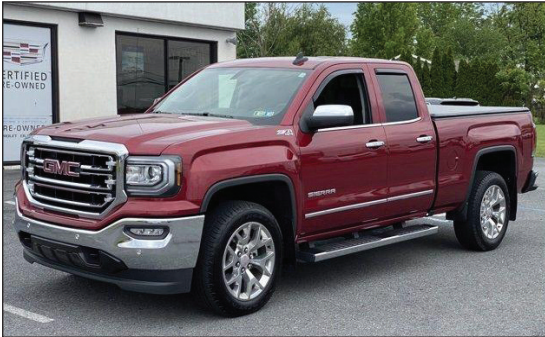
2018 GMC Sierra 1500 SLT G21343A, 4x4, 8K Miles

3 LOCATIONS: FLEETWOOD • MORGANTOWN • PREOWNED SUPERSTORE RT. 222