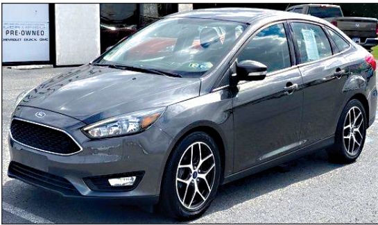
2017 Ford Focus SEL U5870, Low Miles