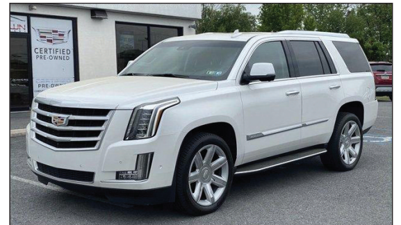
2017 Cadillac Escalade U588T, Reg Ext., Lux Model, 30K Miles