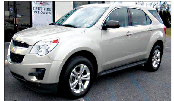
2015 Chevy Equinox U5457B, Low Miles, AWD