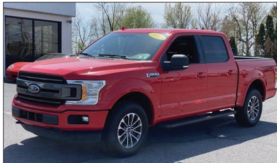
2018 Ford F150 XLT U5867, 4x4, Turbo, Only 23K Miles