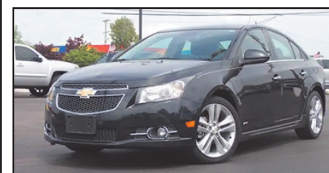
2014 CHEVROLET CRUZE LTZ