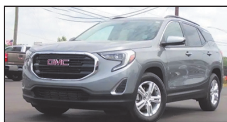
2018 GMC TERRAIN SLE