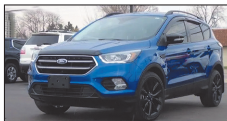
2017 FORD ESCAPE TITANIUM