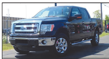
2017 FORD F-150 XLT