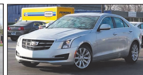
2018 CADILLAC ATS