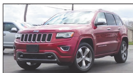
2015 JEEP GRAND CHEROKEE