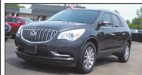
2015 BUICK ENCLAVE