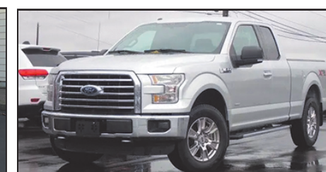
2016 FORD F-150 XLT