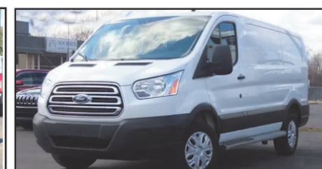
2017 FORD TRANSIT VAN 250