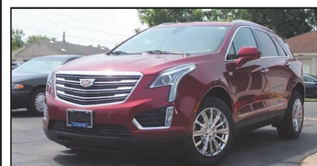
2017 CADILLAC XT5