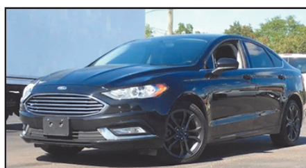
2018 FORD FUSION SE