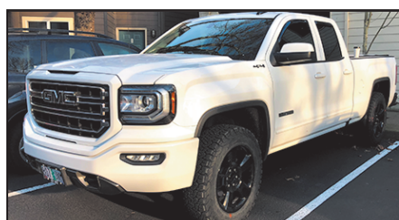
2017 GMC SIERRA 1500 ELEVATION