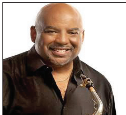
Gerald Albright will perform in concert at the Lake Arbor, South Pointe at the National Harbor on Friday, July 9, 2021.