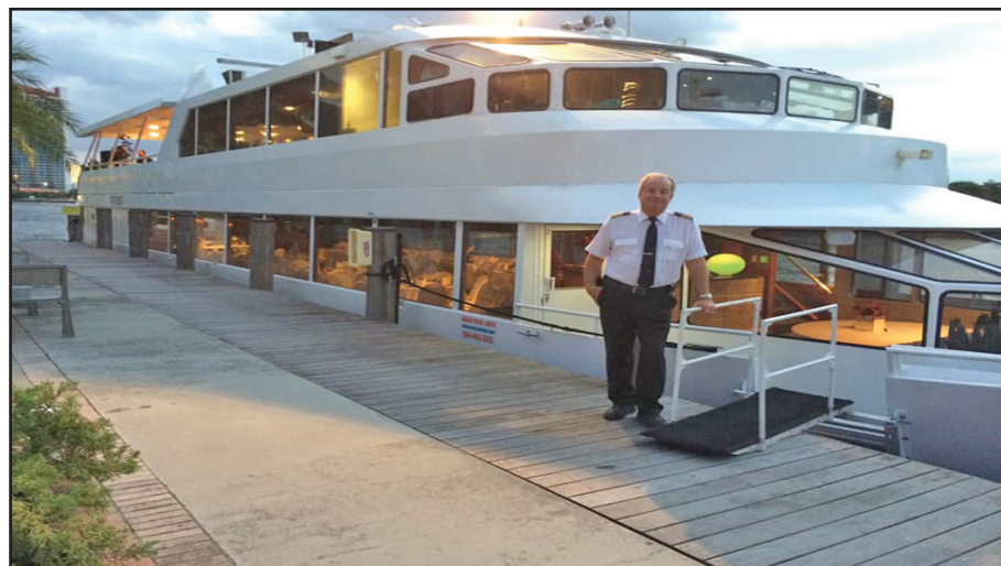
The Maryland Party Boat kicks off celebrations for the 4 th of July holiday weekend with The Glow In The Dark Party on Friday July 2, 2021 at 8 p.m. For more information and tickets, visit: MarylandPartyBoat.com .