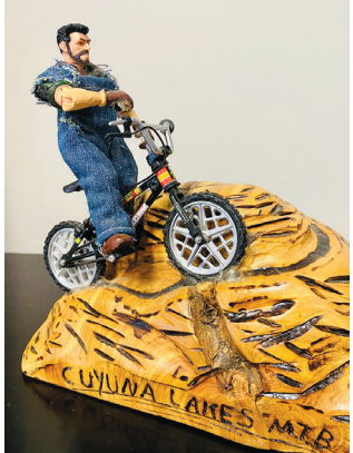
No one found Munchy at Iron Range Eatery by following Clue #4.

Where's Munchy? is a weekly scavenger hunt where participants search for the Munchy the Miner figurine, which will be hidden at participating downtown businesses