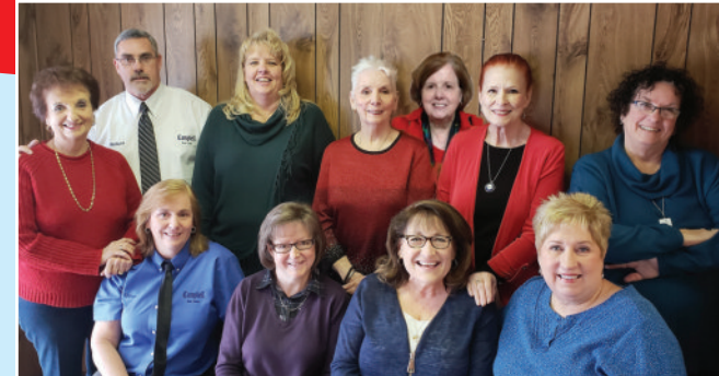
Meet the TLC Staff "Proudly Serving Our Customers With Tender Loving Care!"