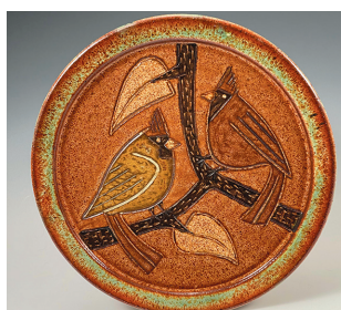
Cardinal plate - Pedar Hegland, stoneware.

surface—a pot—is a new experience for me."