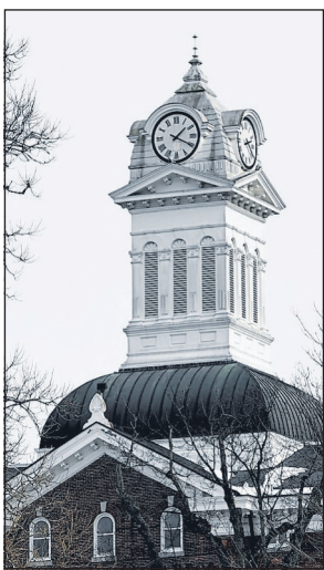
Old Main on the campus of Kutztown University.

The Student Success Center holds workshops throughout each semester to teach strategies such as time management, test-taking, note-taking and textbook reading, including how to implement these skills in both in-person and online environments.