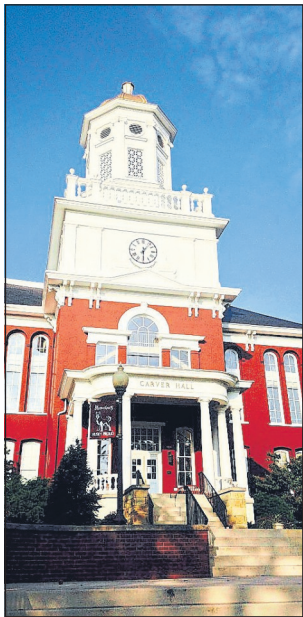
Carver Hall at Bloomsburg University.

At BU, we know you learn inside and outside the classroom. That's why our commitment to Professional U – providing at least one