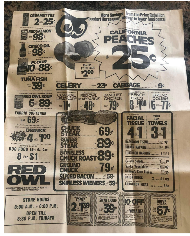
Check out these prices from a 1971 Aitkin Red Owl ad that was discovered in the time capsule.

Time capsule finds | Continued from Page 1