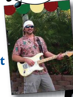
From Casual to Classy