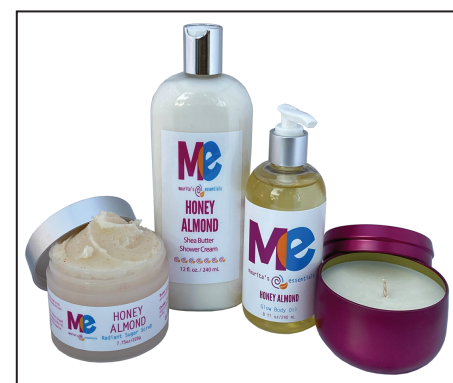
Maurita's Essentials Radiant Glow Gift Set

For more information about Maurita's Essentials, visit https://www.mauritasesentials.com . You can also follow the company on Facebook at https://www.facebook.com/mauritasessentials and on Instagram https://www.instagram.com/mauritalux/