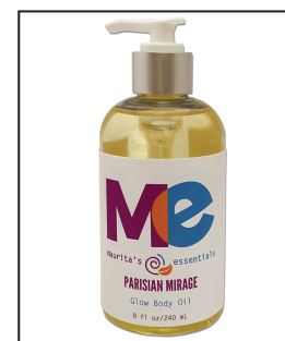
Maurita's Essentials Parisian Massage Glow Body Oil.