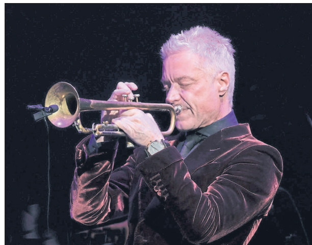
Chris Botti has played 250 to 300 shows each of the last 17 years.

The group slowly shifts content throughout its summer and fall shows so that by the time the Blue Note residency rolls around, the set list features about 30% to 40% new material.