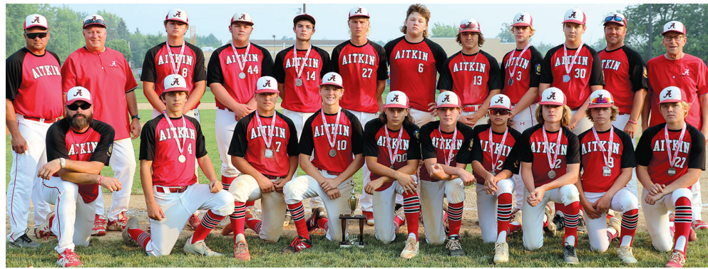
Aitkin Legion Junior Baseball team placed second in the tournament on July 29 in Aitkin.