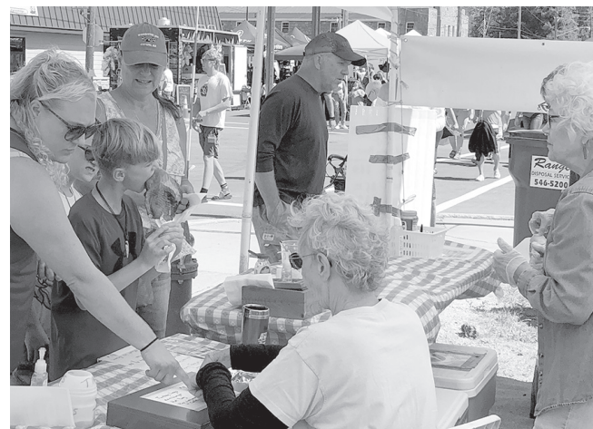
The Cuyuna Range Lions food tent attracted crowds with their selection of hamburgers, hot dogs and (most of all) jumbo smoked turkey legs provided by Emily Meats. Other supplies were provided by Super One Foods.

uncertain future, hearts are heavy in today's world. But for one day, in a little Crow Wing County town, summer came back, briefly, as we all remember it to be.