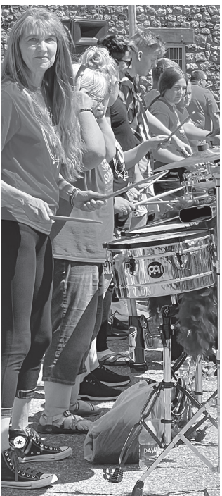
Sheltered Reality performed in the Salem Lutheran parking lot.