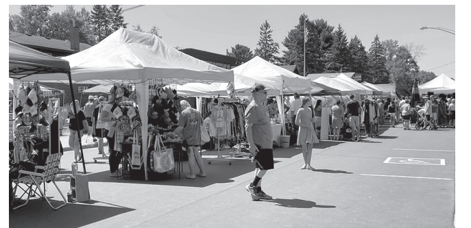
Summerfest-goers were treated to many tents packed with unique and hand-crafted items for sale.