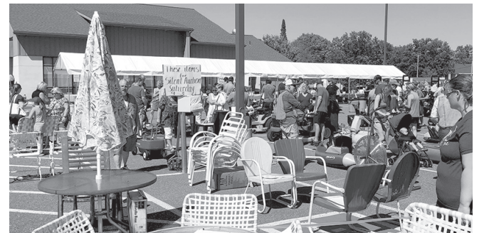
Astute shoppers hurried to scoop up great bargains and rare items at the Salem Lutheran silent auction on Saturday.