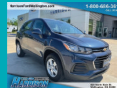
'18 CHEVROLET TRAX LS $18,533