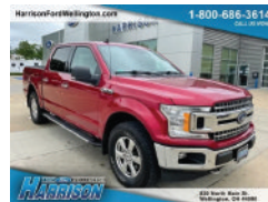
'19 F-150 XLT $36,101