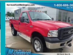
'07 FORD F-350 XL $14,516