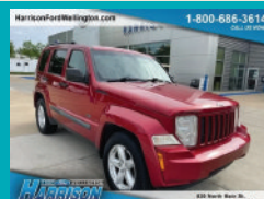
'09 JEEP LIBERTY ROCKY MOUNTAIN $8,844