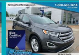
'15 FORD EDGE SEL $16,153