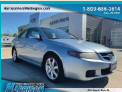
'04 ACCURA TSX $7,492