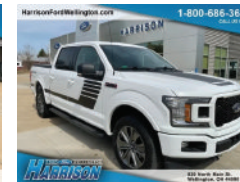
'18 F-150 XLT $40,936