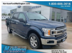
'19 F-150 XLT $41,632