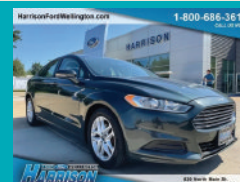
'16 FORD FUSION SE $13,959