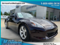
'10 NISSAN 370Z TOURING $17,847