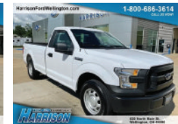
'17 F-150 XL $26,672