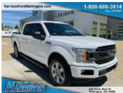
'19 F-150 XLT $42,126