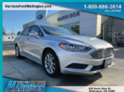
'17 FORD FUSION SE $17,735