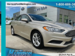
'18 FORD FUSION SE $18,934