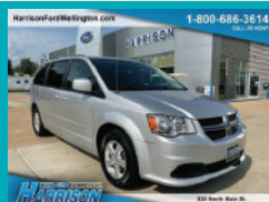
'12 DODGE GRAND CARAVAN SXT $8,787