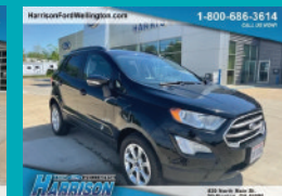
'18 FORD ECOSPORT SE $19,003