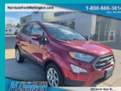
'18 FORD ECOSPORT SE $18,221