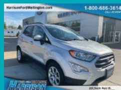
'18 FORD ECOSPORT SE $17,973