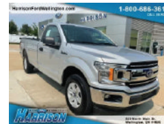
'19 F-150 XLT $28,987