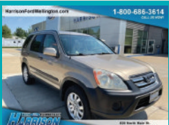
'05 HONDA CR-V EX $4,962