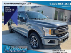
'19 F-150 XLT $40,662