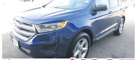
NEW 2015 Ford Edge