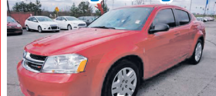
2014 Dodge Avenger