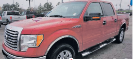
2010 Ford F-150