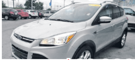
2014 Ford Escape