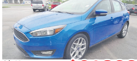
NEW 2015 Ford Focus