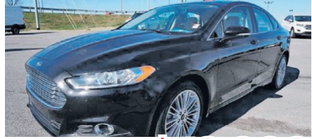
2014 Ford Fusion