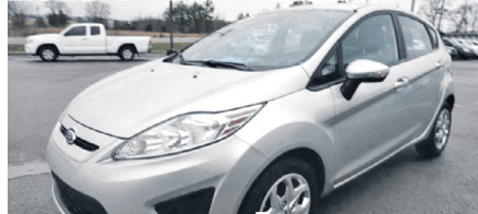
2013 Ford Fiesta