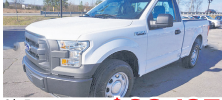
NEW 2016 Ford F-150