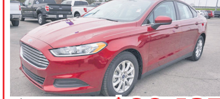
NEW 2016 Ford Fusion