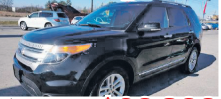
2014 Ford Explorer