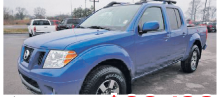
2012 Nissan Frontier