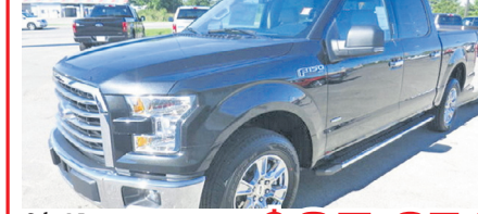
NEW 2015 Ford F-150