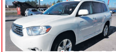
2010 Toyota Highlander