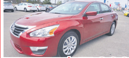
2014 Nissan Altima