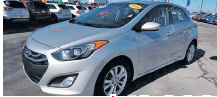
2014 Hyundai Elantra CT