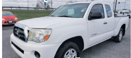
2005 Toyota Tacoma