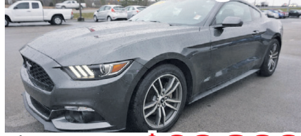
2015 Ford Mustang Prem