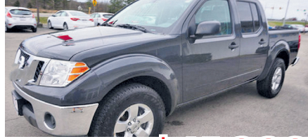
2011 Nissan Frontier