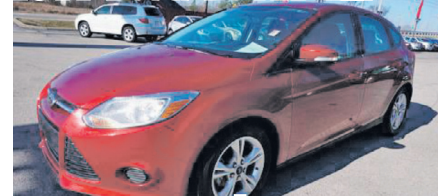
2014 Ford Focus HB