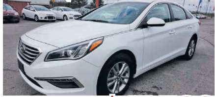
2015 Hyundai Sonata