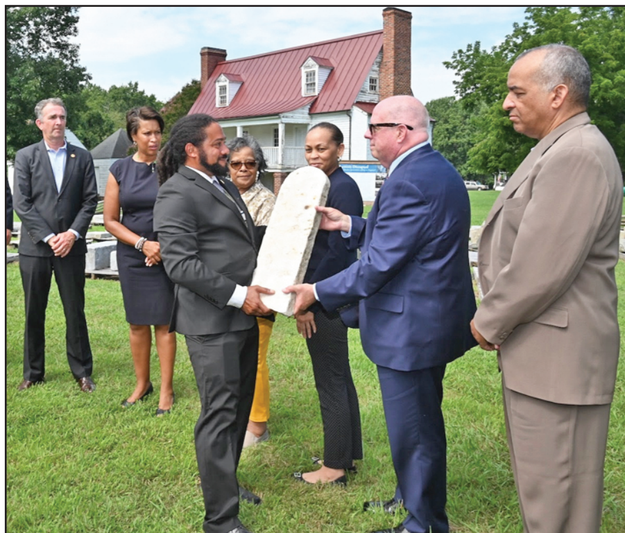
Officials from Maryland, Virginia and the District of Columbia at the ceremony held at Caledon State Park in King George, Virginia, for the official transfer of 55 historic African American headstones to National Harmony Memorial Park in Prince George's Count, Maryland. The State of Maryland, the Commonwealth of Virginia, and the District of Columbia entered into an unprecedented agreement to recover and move the headstones to their rightful place.

"It's our duty to make sure these headstones are returned to the graves