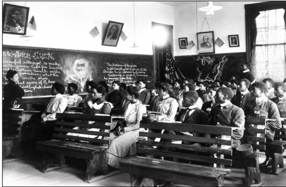
A history class at the Tuskegee Institute, a coeducational elementary and secondary school for African Americans founded in 1881. Georgia, ca. 1902.