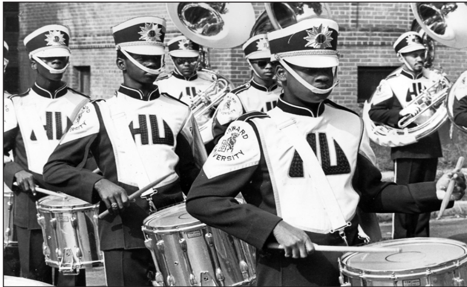
Marching band at Howard University during parade, Washington DC, 1978, Original Caption Reads: 'The Howard University Marching Band Drummers Give The Best To The Marchers'.