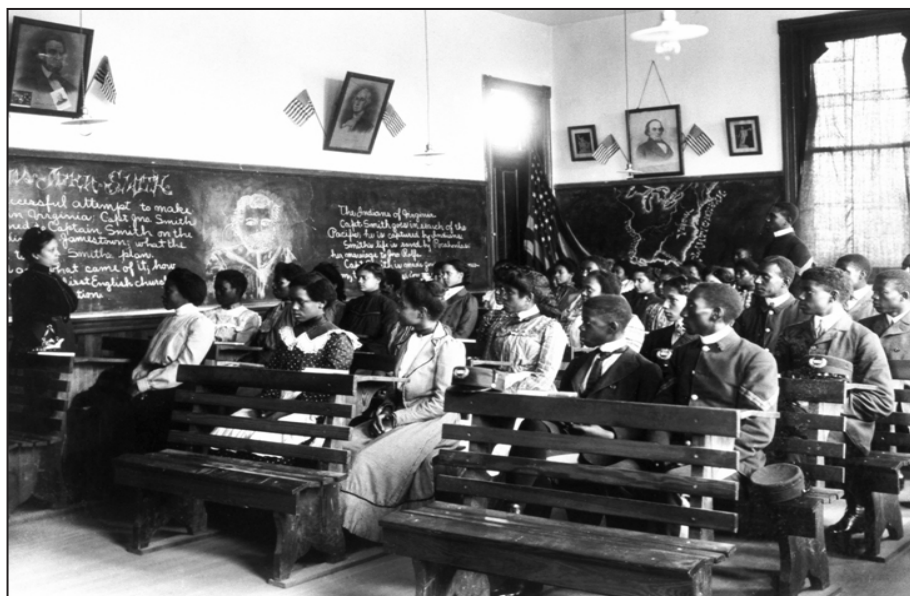
A history class at the Tuskegee Institute, a coeducational elementary and secondary school for African Americans founded in 1881. Georgia, ca. 1902.