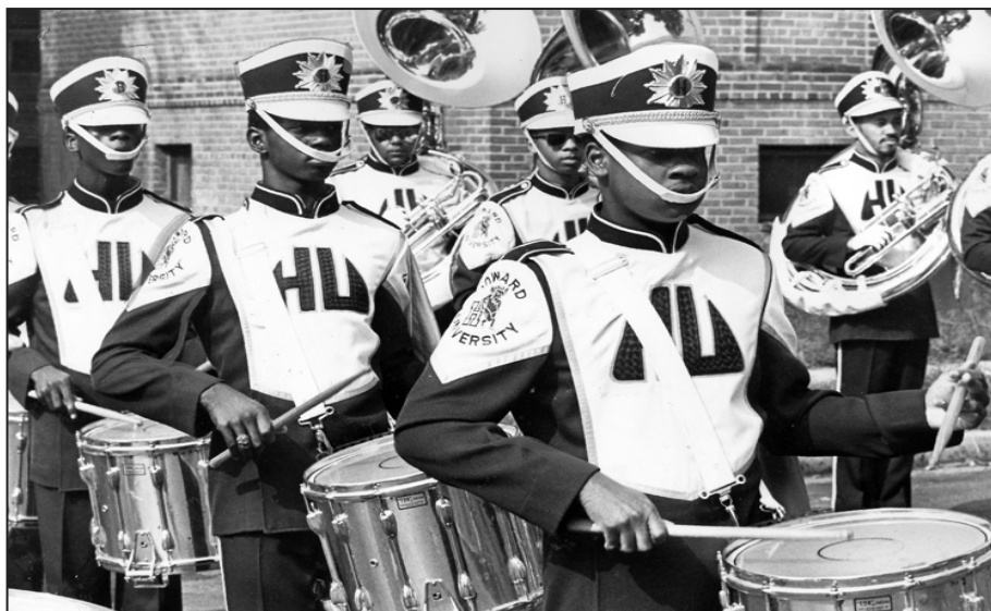
Marching band at Howard University during parade, Washington DC, 1978, Original Caption Reads: 'The Howard University Marching Band Drummers Give The Best To The Marchers'.