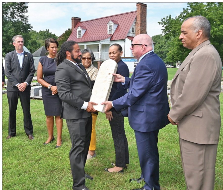
Officials from Maryland, Virginia and the District of Columbia at the ceremony held at Caledon State Park in King George, Virginia, for the official transfer of 55 historic African American headstones to National Harmony Memorial Park in Prince George's Count, Maryland. The State of Maryland, the Commonwealth of Virginia, and the District of Columbia entered into an unprecedented agreement to recover and move the headstones to their rightful place.

"It's our duty to make sure these headstones are returned to the graves