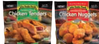
John Soules Foods Breaded Chicken Patties, Nuggets Or Tenders - 24 oz. pkg.