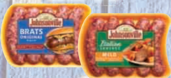
Johnsonville Sausage Or Brats Selected Varieties - 19 oz. pkg.