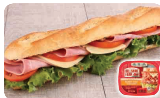
Hillshire Farm Lunch Meat Selected Varieties - 7-9 oz. pkg.