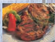
Bone-In Pork Butt Steaks Fresh