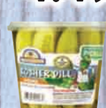
Farm Ridge Foods Pickles Selected Varieties - 24-32 oz. ctn.