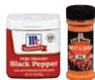
McCormick Pure Ground Black Pepper 3 oz. ctn.