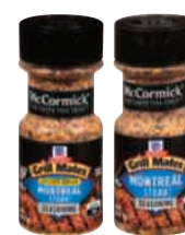
McCormick Grill Mates Seasoning Selected Varieties 2.12-3.5 oz. ctns.