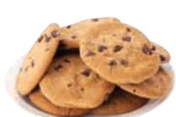
Fresh Baked Cookies 10-12 ct. pkg., Selected Varieties