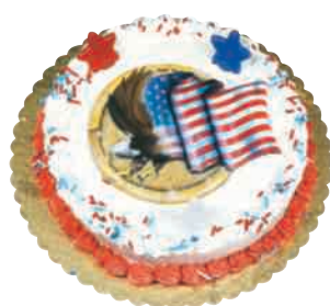
8 Inch Single Layer Iced Cakes Selected Varieties