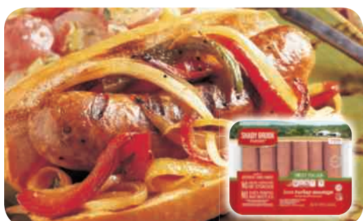
Shady Brook Farms Italian Turkey Sausage Sweet Or Hot - 1.25 lb. pkg.