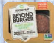
Beyond Meat Beyond Burger 8 oz. pkg.