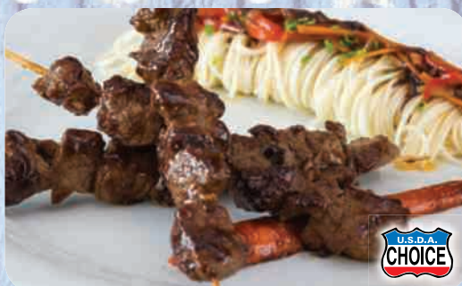
Round Stew For Kabobs USDA Choice Beef