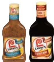
Lawry's 30 Minute Marinades Selected Varieties 12 oz. btl.