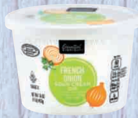
Essential Everyday French Onion Dip 16 oz. ctn.