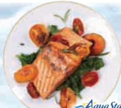
AquaStar Value Added Seafood Selected Varieties