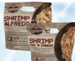
Legasea Shrimp Entrees Selected Varieties