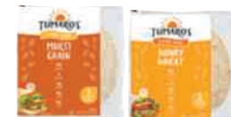
Tumaro's Wraps 11.2 oz. pkg., Selected Varieties