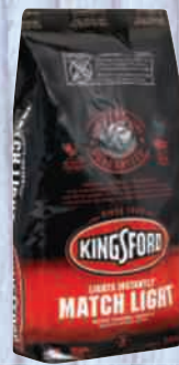
Kingsford Or Match Light Charcoal Briquets Original 12-16 lb. bag