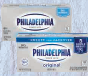
Philadelphia Cream Cheese Original Or 1/3 Less Fat 8 oz. bricks