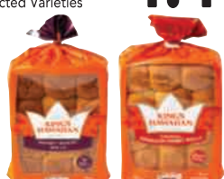
King's Hawaiian Dinner Rolls 12 ct. pkg., Original, Savory Butter Or Wheat