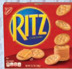
Nabisco Snack Crackers Or Triscuit Selected Varieties - 3.5-9.1 oz. boxes Nabisco Ritz Crackers Selected Varieties - 8.8-13.7 oz. boxes