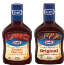
Kraft Barbecue Sauce Selected Varieties 17.5-18 oz. btl.