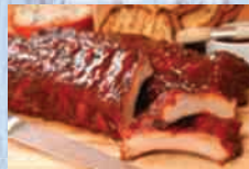
Spartanburg Fully Cooked Pork Ribs In Sauce - 1.5 lb. pkg.