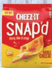
Cheez-it Or Snap'd Crackers

Selected Varieties 7.5 oz. pkgs. Or 9-12.4 oz. boxes