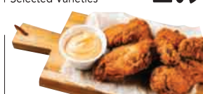
15 Piece Wing Dings Or Zings Deli Fresh