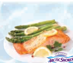
Arctic Shores Salmon Fillets IQF