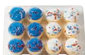
Iced Mini Cupcakes 12 ct. pkg., Chocolate Or Golden