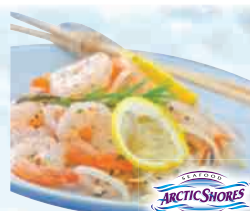
Arctic Shores 26/30 Count Cooked Peeled Shrimp Arctic Shores Tail-On IQF