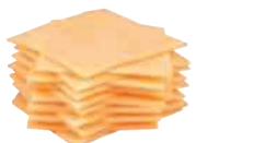
Land O Lakes American Cheese Deli Fresh, White Or Yellow