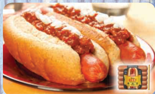
Oscar Mayer Beef Franks Or Cheese Dogs Selected Varieties - 15-16 oz. pkgs.