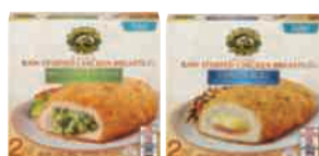
Barber Foods Stuffed Boneless Chicken Breasts Selected Varieties - 10 oz. pkg.