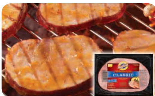
Hatfield Boneless Ham Steaks Selected Varieties - 8 oz. pkg.