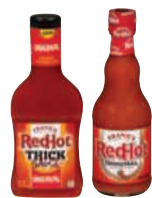
Frank's RedHot Hot, BBQ Or Wing Sauce Selected Varieties 12-14 oz. btl.