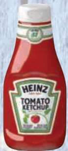
Heinz Tomato Ketchup 38 oz. btl.