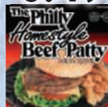
The Philly Homestyle Beef Patty 64 oz. box