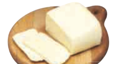
Signature Mozzarella Cheese Deli Fresh