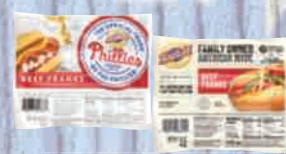
Hatfield Or Phillies Beef Franks 1 lb. pkg.