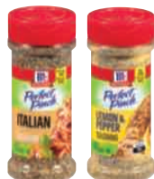
McCormick Perfect Pinch Seasonings Selected Varieties 1.31-7 oz. ctns.