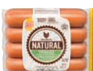
Oscar Mayer Natural Hardwood Smoked Turkey Franks 16 oz. pkgs.