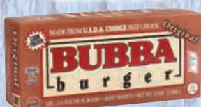
Bubba Beef Burger Selected Varieties - 2 lb. box