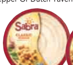
Sabra Hummus 10 oz. ctn., Selected Varieties