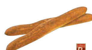
La Brea Twin Pack Baguettes 12 oz. pkg.