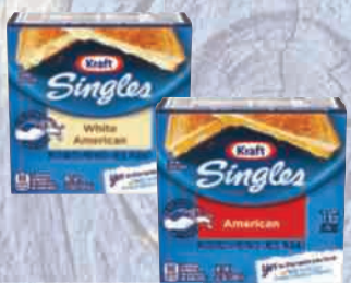
Kraft Cheese Singles Selected Varieties 10.7-12 oz. pkgs.