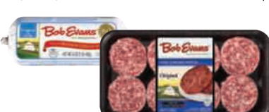
Bob Evans Sausage Links, Patties Or Rolls Selected Varieties - 9.6-16 oz. pkgs.