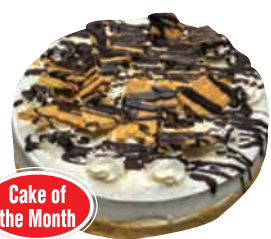
8 Inch Double Layer S'mores Cake