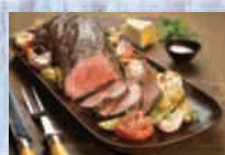
Whole Beef Tenderloin For Filet Mignon USDA Choice Beef