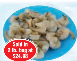
Paul Piazza 16/20 Count White Raw Shrimp IQF