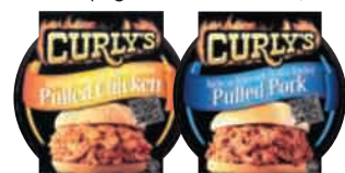
Curly's Pulled Pork Or Chicken 16 oz. tub