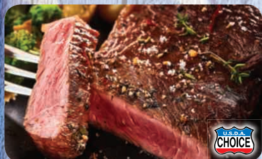
Top Round Steaks USDA Choice Beef