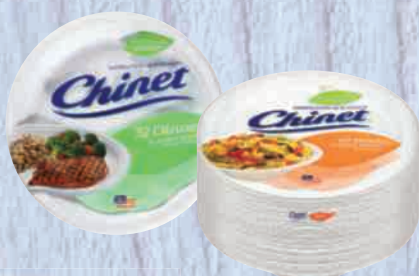
Chinet Plates Or Bowls Selected Sizes & Styles 24-70 ct. pkg.