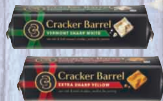
Kraft Cracker Barrel Bar Cheese Selected Varieties 8 oz. pkg.