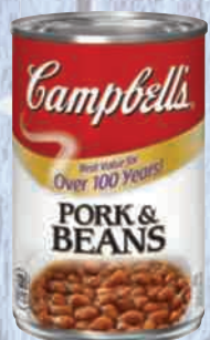
Campbell's Pork & Beans 11 oz. can