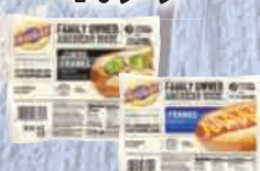
Hatfield Meat Franks Classic Or Jumbo - 1 lb. pkgs.