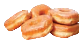
Maple Donuts Jumbo Glazed Rings 27 oz. pkg.