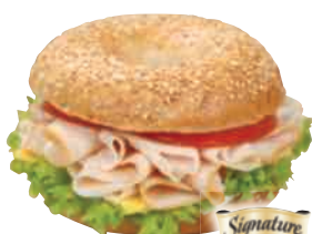
Signature Browned Turkey Breast Deli Fresh