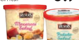
Reser's Amish Macaroni Or Potato Salad 3 lb. tub