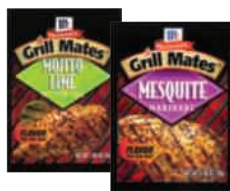
McCormick Grill Mates Marinade Mixes Selected Varieties 7.1-1.25 oz. pkts.