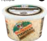
BelGioioso Cheese Cup 5 oz. pkg., Selected Varieties