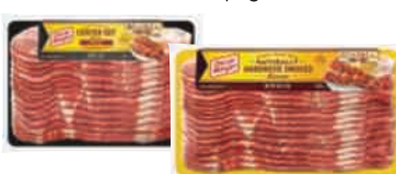
Oscar Mayer Sliced Bacon Selected Varieties - 12-16 oz. pkg.