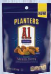
Planters Peanuts Or Flavored Nuts Selected Varieties 5.5-16 oz. pkgs.