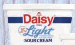
Daisy Sour Cream Selected Varieties 8 oz. ctns.