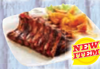
Dickey's Dry Rubbed Spareribs Frozen Original, Sweet Or Sizzlin