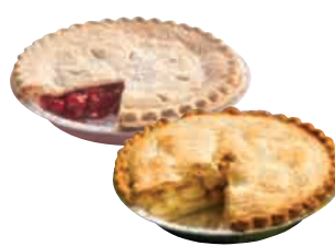
8 Inch Fruit Pies Selected Varieties