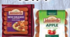
Johnsonville Chicken, Smoked Sausage Links, Ropes Or Bratwursts Selected Varieties - 12-14 oz. pkg.