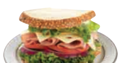
Berks Ham Deli Fresh, Pepper Or Dutch Tavern