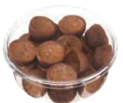
Two Bite Brownies 10.5 oz. tub