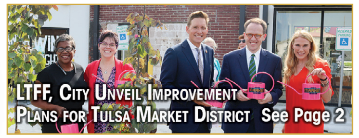
LTFF, CITY UNVEIL IMPROVEMENT PLANS FOR TULSA MARKET DISTRICT See Page 2