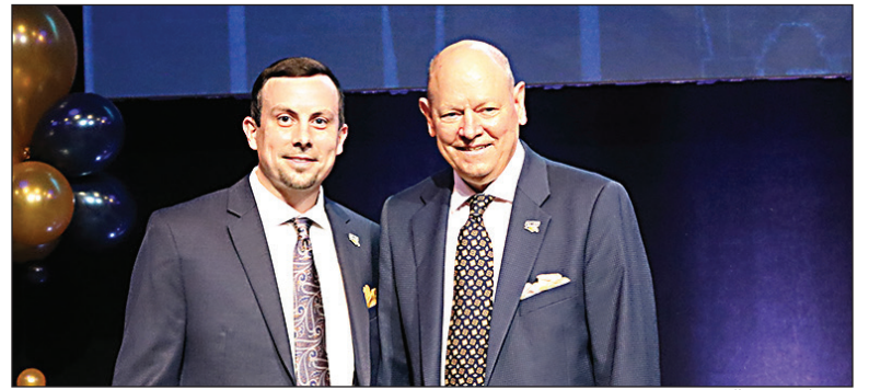
GTR Media group photo