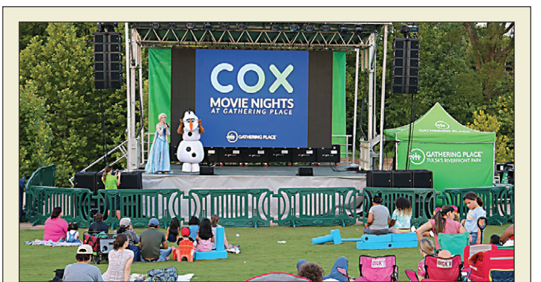
MOVIE NIGHT AT GATHERING PLACE: Cox Movie Nights on the QuikTrip Great Lawn at Gathering Place began this year in the summer and will continue with The Princess & The Frog Sept. 17, Hocus Pocus Oct. 22, and the live-action version of The Lion King Nov. 12. All Cox Movie Nights are free to the public, and guests are welcome to bring lawn chairs and picnic blankets to watch the film. Visit www.gatheringplace.org for more information.