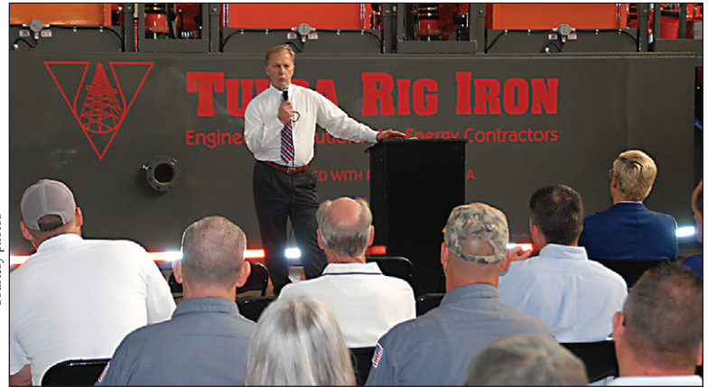
TOWN HALL: Rep. Kevin Hern addresses the crowd at a recent "I Make America" event at Tulsa Rig Iron's manufacturing facility in Kiefer, Okla. before taking questions in the town hall portion of the event.