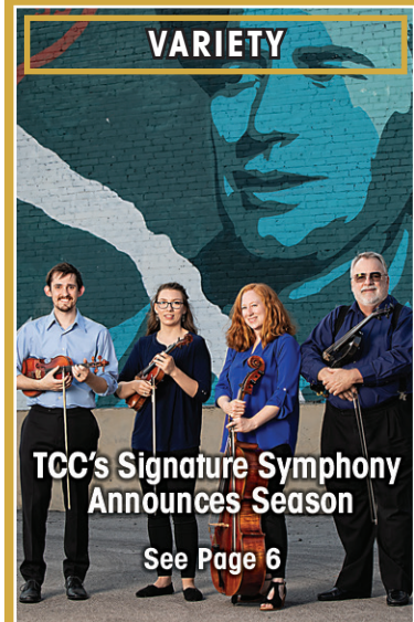
TCC'S SIGNATURE SYMPHONY ANNOUNCES SEASON See Page 6