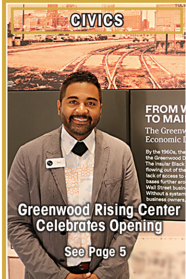
GREENWOOD RISING CENTER CELEBRATES OPENING See Page 5