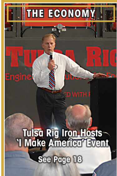
TULSA RIG IRON HOSTS 'I MAKE AMERICA' EVENT See Page 18