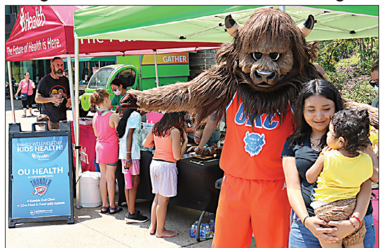
RUMBLE FOR HEALTH: Rumble, the Oklahoma City Thunder mascot, entertained youngsters at Gathering Place during Family Health Day in August.