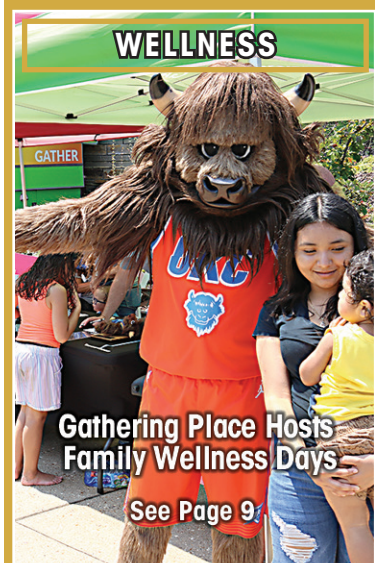
GATHERING PLACE HOSTS FAMILY WELLNESS DAYS See Page 9