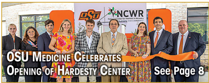
OSU MEDICINE CELEBRATES OPENING OF HARDESTY CENTER See Page 8