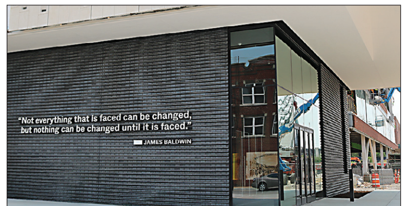
NEW TULSA DESTINATION: The world-class Greenwood Rising History Center is located at 23 North Greenwood Avenue in Tulsa.