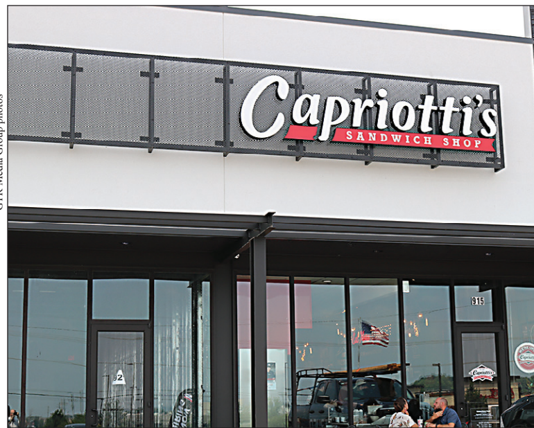
POPULAR DESTINATION: Capriotti's new location in Broken Arrow is in Tiger Hill Plaza at 915 East Kenosha St. Capriotti's brings the Broken Arrow community delicious menu items.