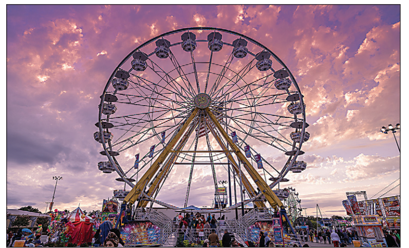
RETURN OF THE MIDWAY: The midway is expected to return to this year's Tulsa State Fair to give fair goers a fun and thrilling time.

check out the entertainment schedules and don't miss out on savings by purchasing tickets early. Tickets on sale now include Advance