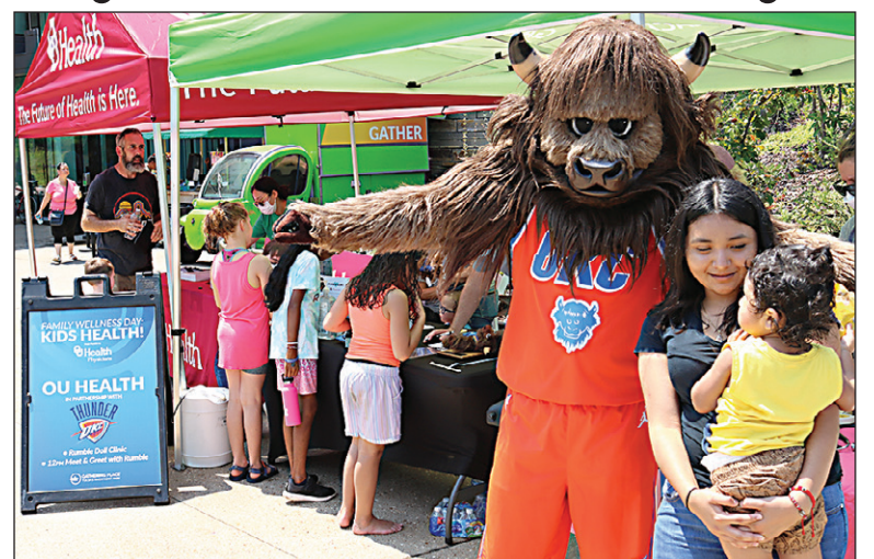
RUMBLE FOR HEALTH: Rumble, the Oklahoma City Thunder mascot, entertained youngsters at Gathering Place during Family Health Day in August.