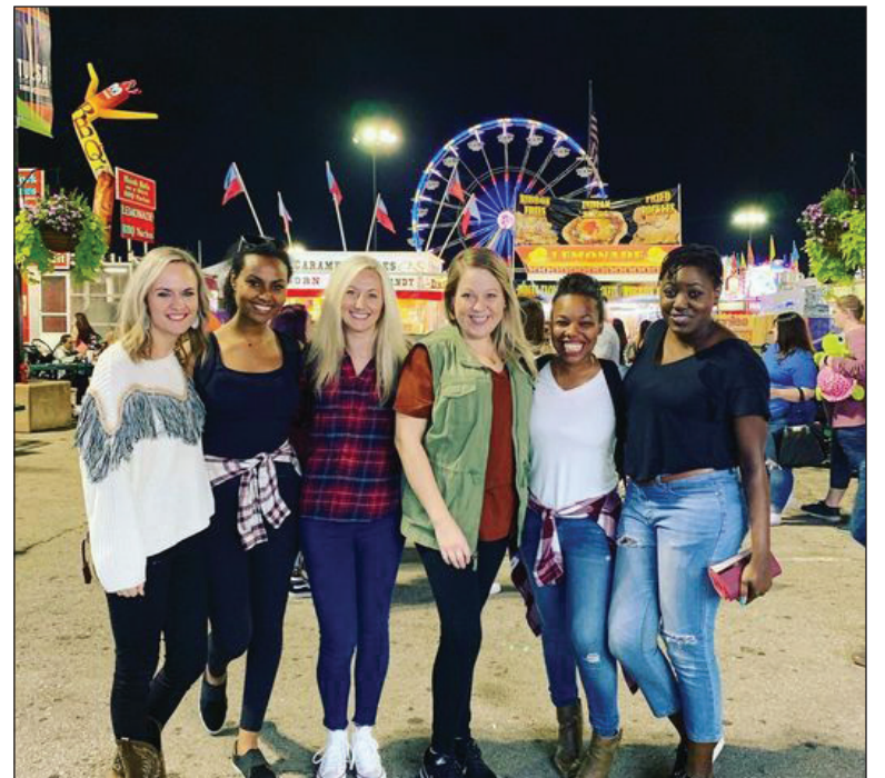
READY FOR FUN: Visitors from a previous Tulsa State Fair are looking forward to this year's event which will see a return to the midway and many more traditional fun Fair events.