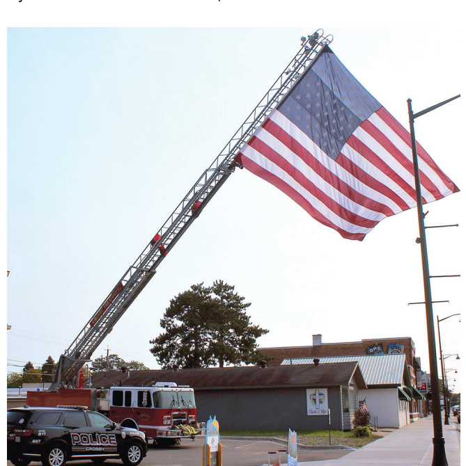
The Crosby Police Department partnered with the Crosby Fire Department to honor the victims of the 9/11 terrorist attacks with this display in downtown Crosby.