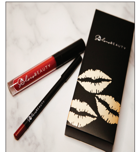
The Mamacita Lip Kit.