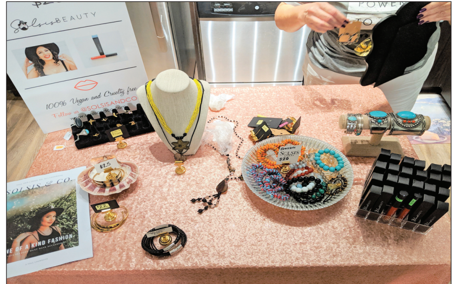
SOLSIS accessories include jewelry pieces from around the world.

“I am big on helping our earth in any and every way,” she said. “I’m very conscientious of that along with the products we use, especially when it comes to people with sensitive skin. It’s always interesting to buy something and read the ingredients and find out there are things in them you didn’t know. I wanted our ingredients to be eco-