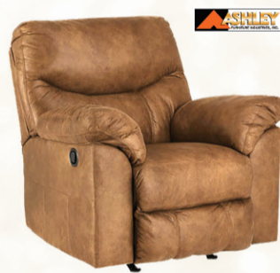
Ashley Rocker Recliner