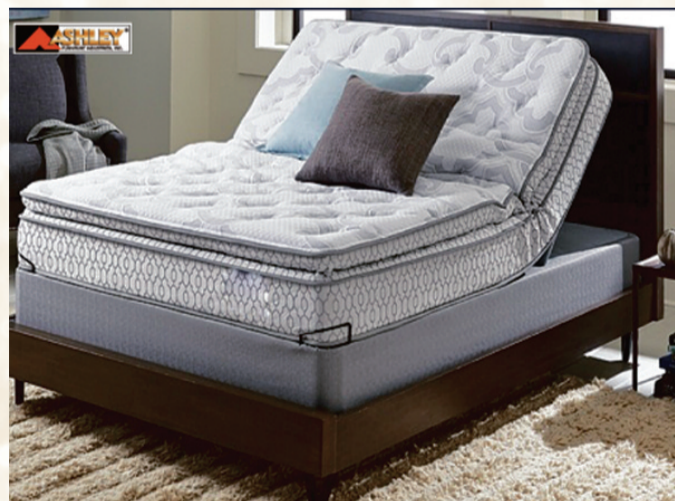
Ashley Queen Size Heads Up Adjustable Pillow Top Set