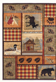
Rustic Room Size Rugs *your choice of designs