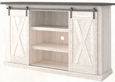
54" Two-Tone TV Console