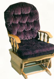
Holland House Oak Glider Rocker