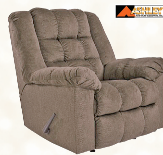
Power Rocker Recliner