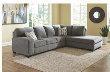
Ashley 2-Piece Sectional *2 colors available