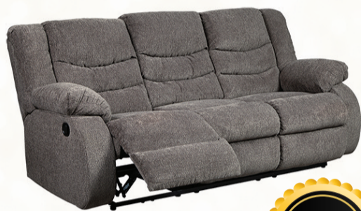
Ashley Tulen Reclining Sofa *Your choice of colors