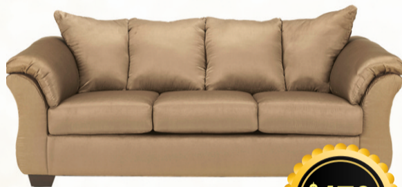
Darcy Mocha Sofa