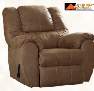
McGann Rocker Recliner 2 Colors Available