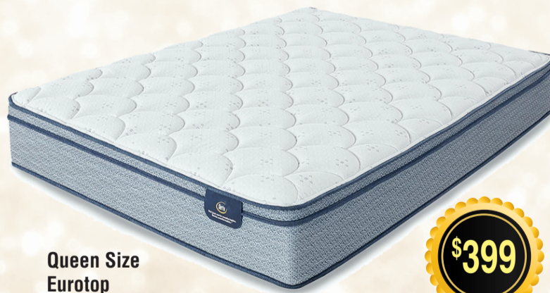
Queen Size Eurotop Mattress Set