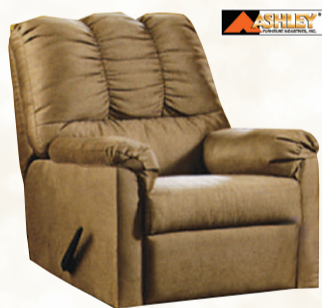
Ashley Durapella Microfiber Rocker Recliner 7 Colors Available