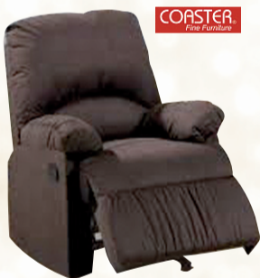
Coaster Wallaway Recliner