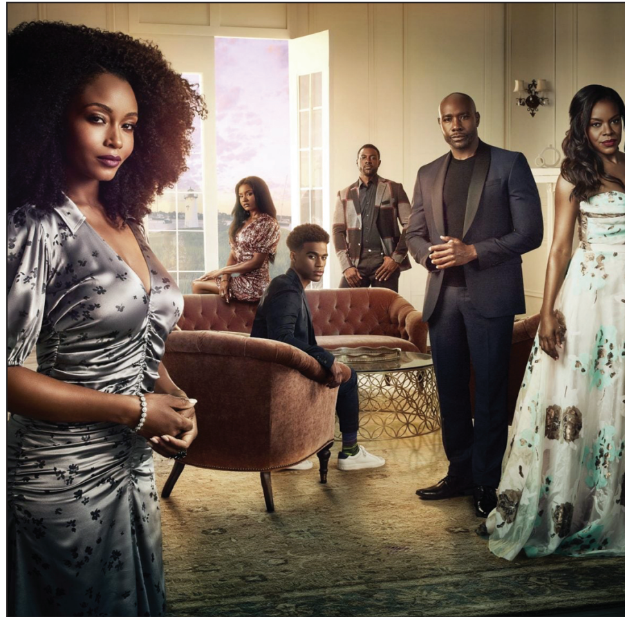
Yaya DaCosta (far left) in promo image for "Our Kind Of People"

Vulnerability, DaCosta asserts, is what she feels is Angela's greatest strength.