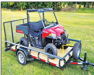
Brand New Polaris Ranger 500 4x4 with Trailer

FAULK COMPANY Como-Pickton FFA Raffle Item