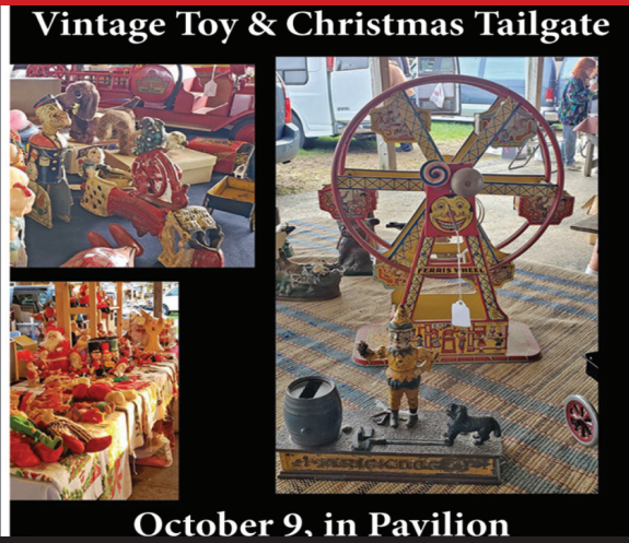
October 9, in Pavilion