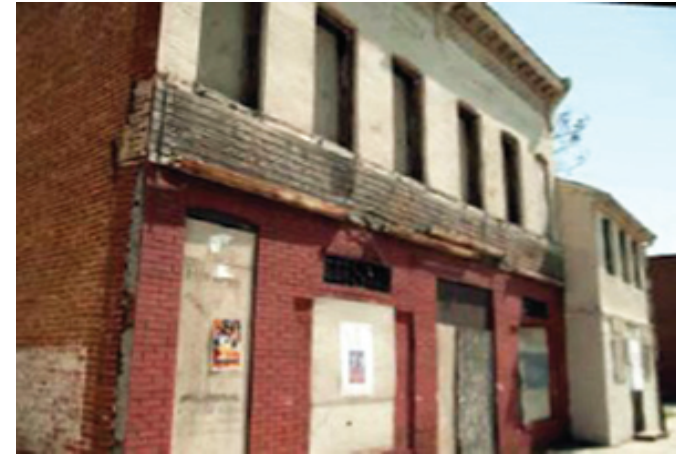
The rendering by architect Klaus Philipsen is among plans being considered for the site. (Right): The Sphinx Club now sits boarded-up along Pennsylvania Avenue.

Park where many icons, including Charles Tilghman will be featured."