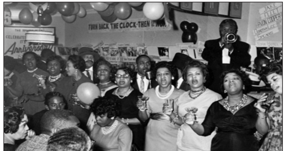
Patrons during a Mardi Gras party at The Sphinx Club during the 1950s.