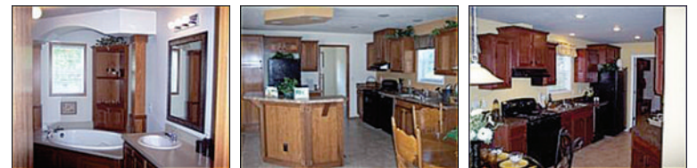
Forest River Housing – Model #156 with optional porch. 3BR, 2B home