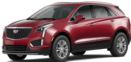
2022 XT5 PREMIUM LUXURY, NAVIGATION, V6