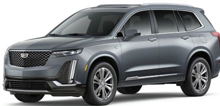
2022 XT6 AWD PREMIUM LUXURY, NAVIGATION, COMFORT & AIR QUALITY PKG, 20" POLISHED WHEELS

Visit our website @ lesstanford.com for details, ask about our build to order campaign.