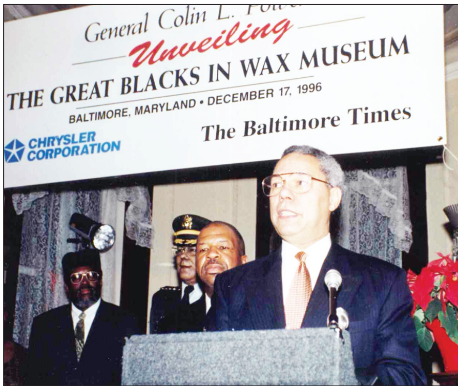
General Powell greeting attendees.