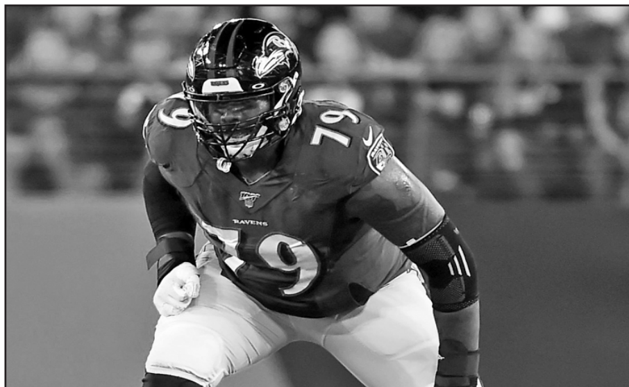
Left tackle Ronnie Stanley was the No. 6 overall pick by the Baltimore Ravens in 2016. Stanley will have season-ending surgery on his injured ankle this year after a severe ankle injury in Week 8 of the 2020 season against the Pittsburgh Steelers.

Stanley will have season-ending surgery on his injured ankle. That's