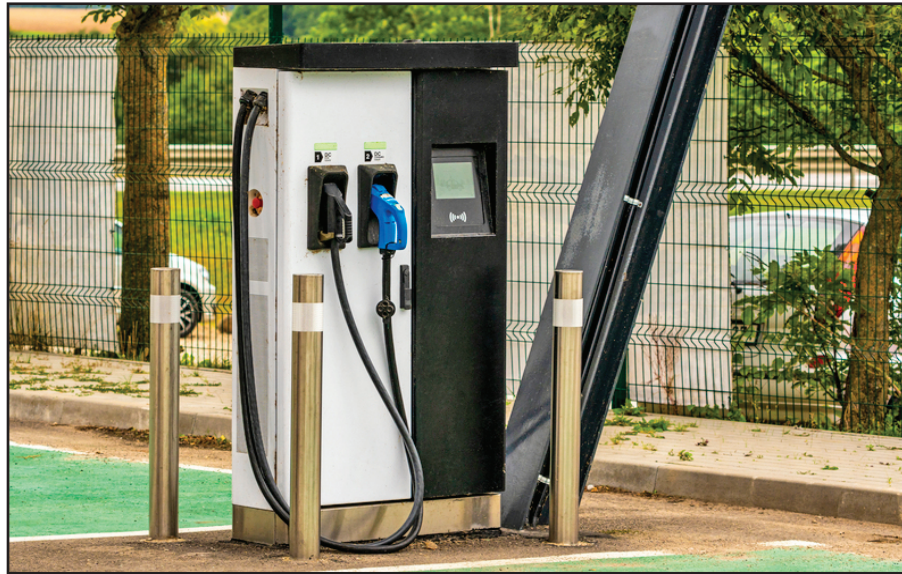
DaiTechCorp installs electric vehicle charging stations for residential and commercial settings. One of the company's prime objectives is to help potential electric vehicle drivers from urban areas overcome range anxiety by equitably increasing their access to Electric Vehicle Charging Stations.

Electric Hybrids or Plug-in Hybrid Electric Vehicles (PHEVs) have two motors. PHEV's utilize two fueling sources. One of the motors is powered by a traditional internal combustion engine (IC engine or ICE). The second is powered by an electric motor. These vehicles have the capabilities to switch back and forth between fuel sources on