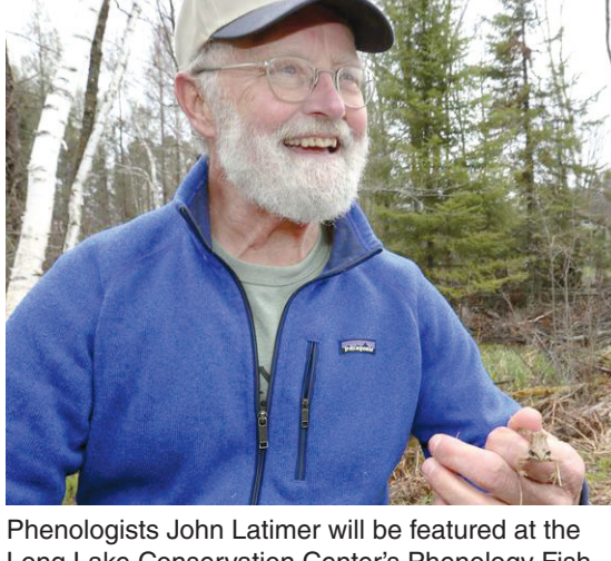
Long Lake Conservation Center's Phenology Fish Fry Fundraiser on Saturday, Nov. 13

son and is limited to the first 125. All proceeds will go towards scholarships so students can attend nature school at Long Lake. The event is made possible thanks to support of the Long Lake Conservation Foundation, a 501(C)3 that supports Long Lake Conservation Center.