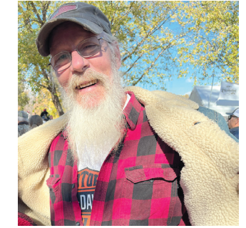
Jimbo from St Louis Park must have gotten the buffalo plaid "memo" too.

There is a special feeling in the air to have seasonal festivals revived—giving us time to make memories with friends and family once again.