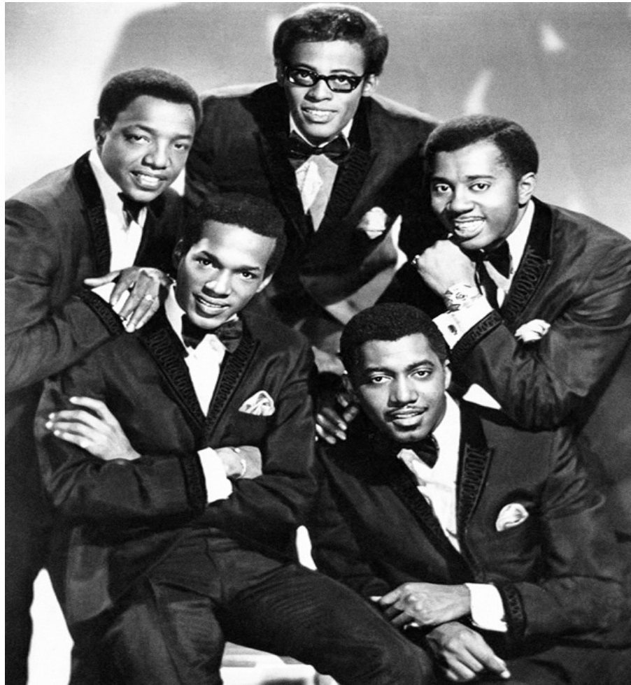
Publicity photo of the "Classic 5" lineup of American band, The Temptations in 1964. Clockwise from top: David Ruffin, Melvin Franklin, Otis Williams, Eddie Kendricks, and Paul Williams.