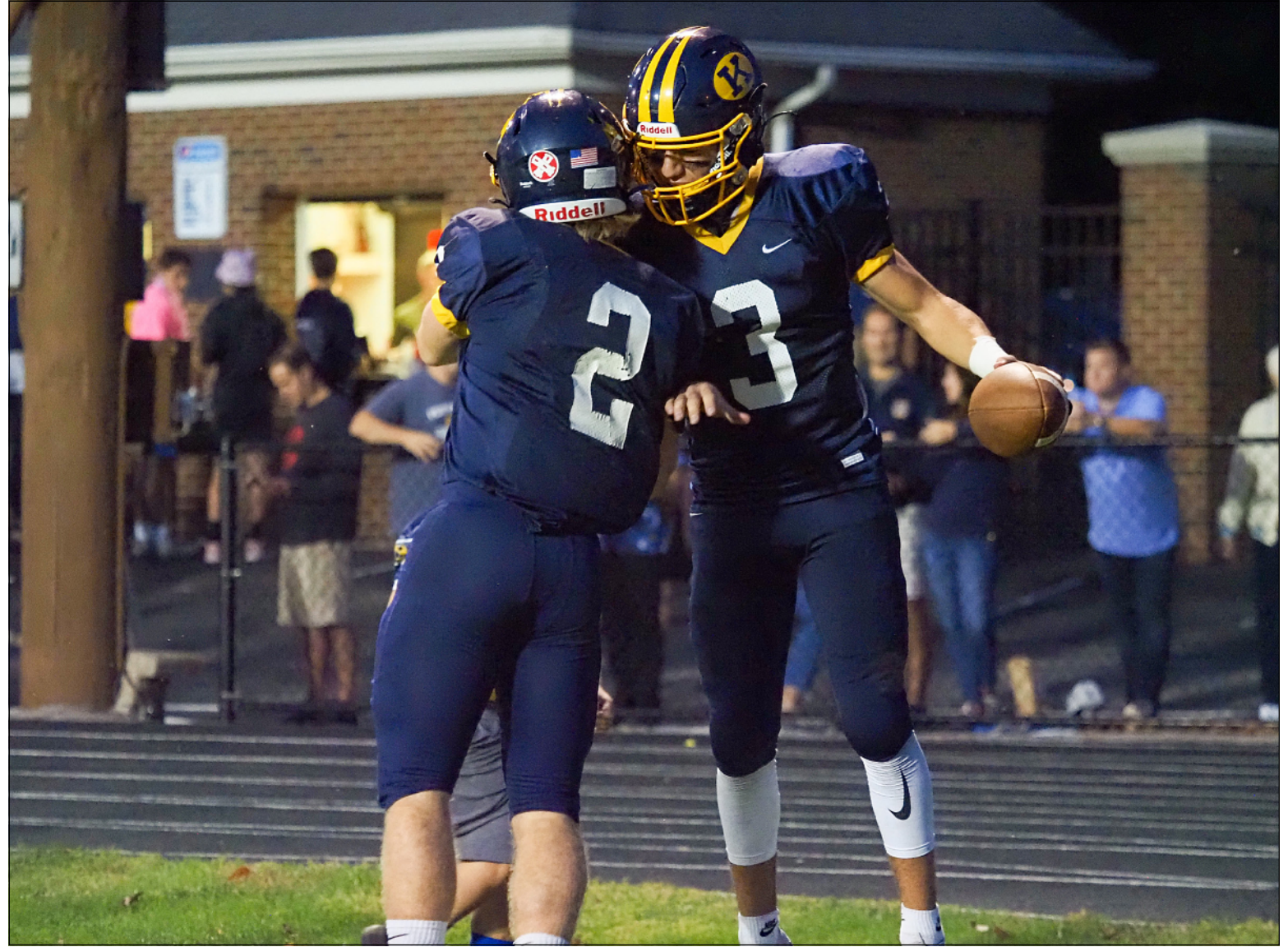
BRIAN FISHER — FOR THE NEWS-HERALD

"Many people don't want to see a team win 15 in a row or consis-