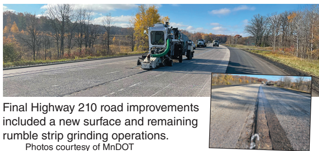
Final Highway 210 road improvements included a new surface and remaining rumble strip grinding operations.