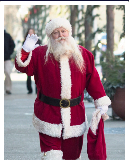
SANTA SERIES & SANTA'S HOUSE Dec. 4-23