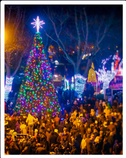
LIGHT UP THE BLUFF Dec. 3 | 6pm