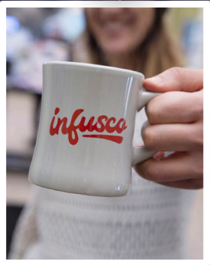
COUNTDOWN TO NEW YEARS Dec. 1-31