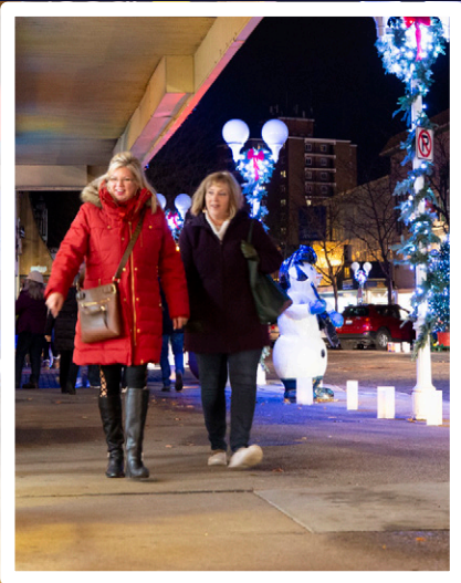
LUMINARY Nov. 19 | 5-8pm