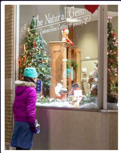
WINDOW WONDERLAND Dec. 3 | 7-8:30pm