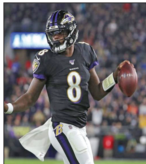
The Dolphins sacked Ravens quarterback Lamar Jackson four times for a loss of 28 yards in game on Thursday, November 11, 2021.

"Cover Zero is like one of those things where you have to make them pay, you know? And, I don't think early on we did that enough," tight end Mark Andrews said. "That's one of the things,