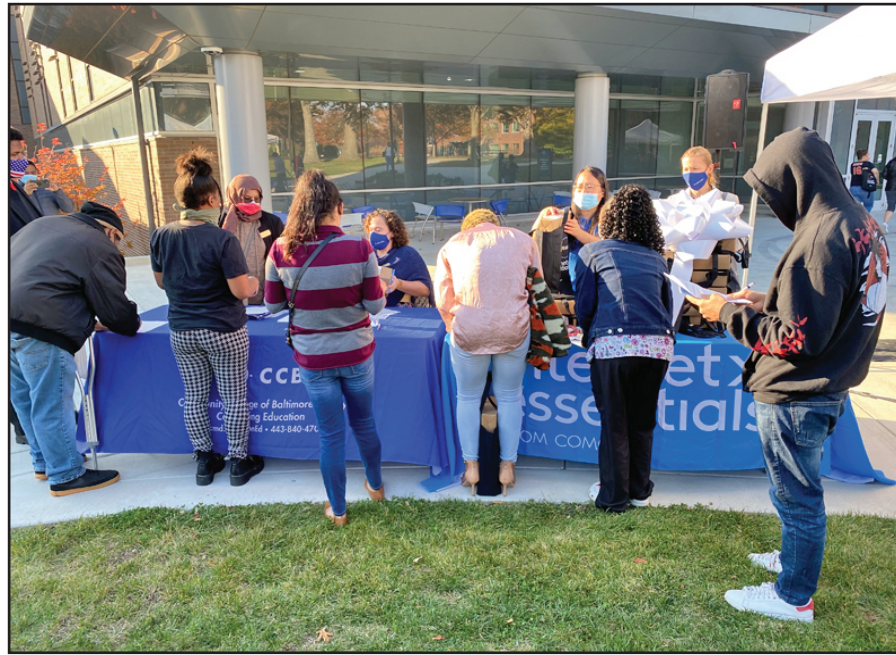
The $30,000 grant awarded to CCBC will support the Student Emergency Aid Fund and the laptops will be given to students enrolled in Adult Literacy Education Programs. (Above) On Thursday, November 11, 2021, the laptops were distributed to the students outside the Administration Building at CCBC Essex Campus.

Beyond the financial grant and laptop donation, Comcast is focused on increasing digital equity with its Internet Essentials program, the nation's largest