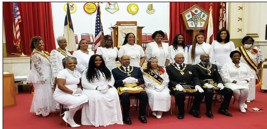
Welcome and congratulations to the new members of the Myra Grand Chapter Order of Eastern Star.