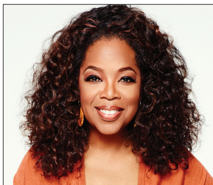
Oprah Winfrey

Equity First began as an effort to support fair and sustainable solutions to combat institutional and structural racism.