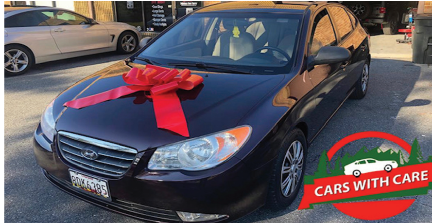
This Christmas, two used cars will be given to two families in need of transportation.

one of the gifts to be presented to a Baltimore resident, and the second to a winner from the Laurel or District of Columbia area. Entries can be submitted from Baltimore, Laurel and Washington, D.C.-based individuals. Participants must also answer questions about their vehicle needs, and share their story, as a part of the selection process. Except for one selected male recipient, previous car winners were single mothers.