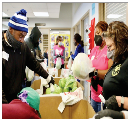
Volunteers bagging cabbage for family Thanksgiving care packages.

volunteering. “It is about giving back and helping out.”