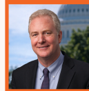
Special Guest Speaker U.S. Senator Chris Van Hollen