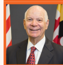
Special Guest Speaker U.S. Senator Ben Cardin