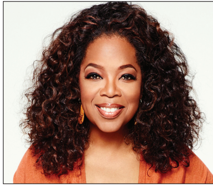
Oprah Winfrey

Equity First began as an effort to support fair and sustainable solutions to combat institutional and structural racism.