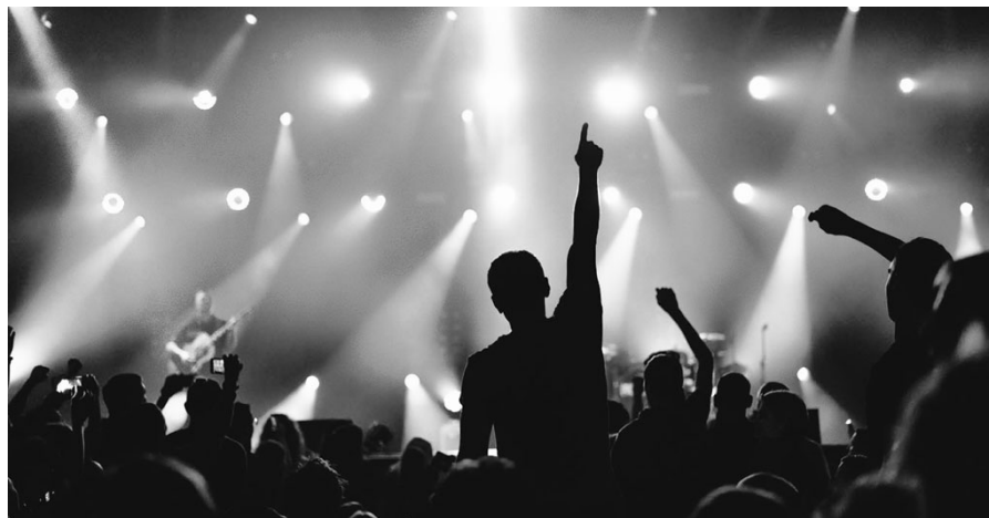
Concerts and festivals generally attract the most ardent of fans.

As the crowd pushed toward the entrance, the surge caused 11 deaths and at least 26 injuries.