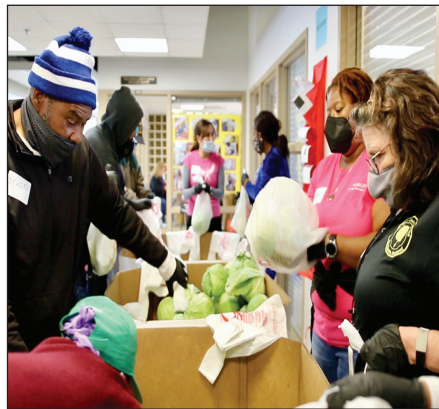
Volunteers bagging cabbage for family Thanksgiving care packages.

volunteering. “It is about giving back and helping out.”