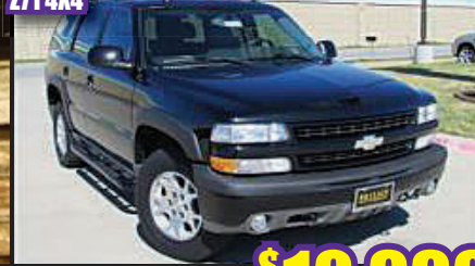
05 Chevy Tahoe