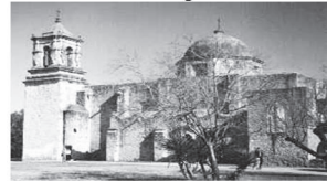
Mission San Jose