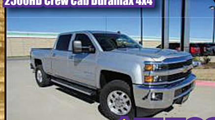
15 Chevy Silverado