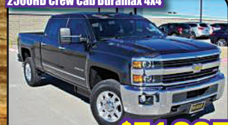
15 Chevy Silverado