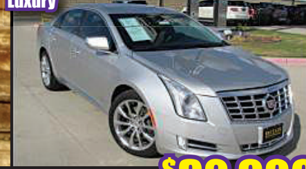
15 Cadillac XTS