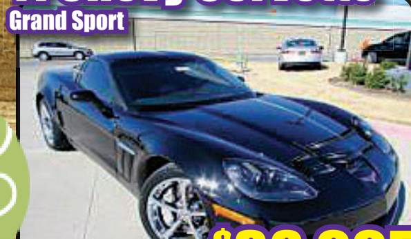
11 Chevy Corvette