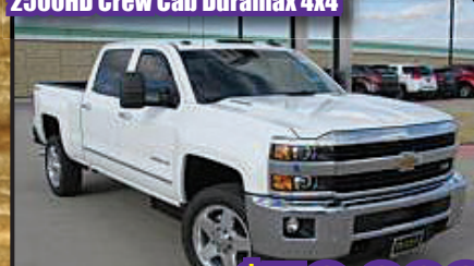
15 Chevy Silverado