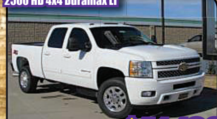
14 Chevy Silverado