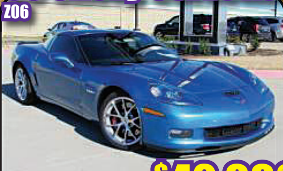
09 Chevy Corvette