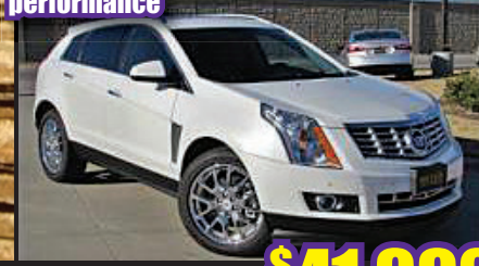
15 Cadillac SRX