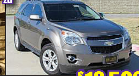
12 Chevy Equinox