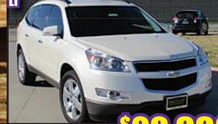
12 Chevy Traverse