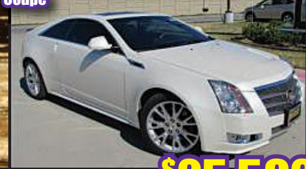
11 Cadillac CTS