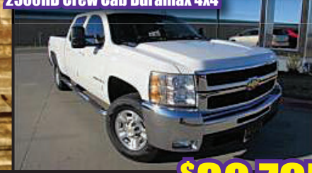
07 Chevy Silverado