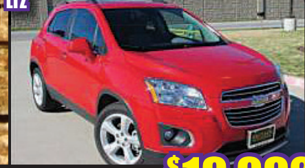
15 Chevy Trax