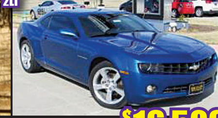
10 Chevy Camaro