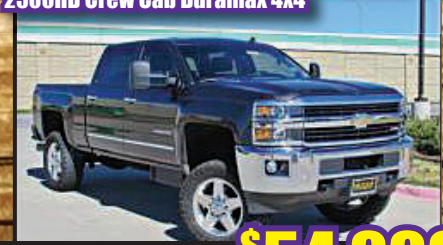
15 Chevy Silverado