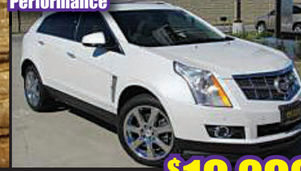
10 Cadillac SRX