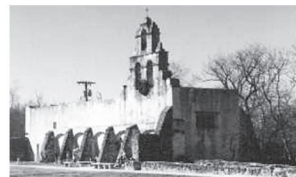
San Juan Capistrano