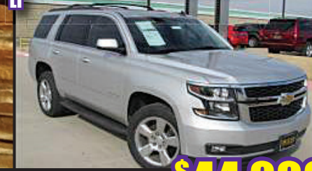
15 Chevy Tahoe