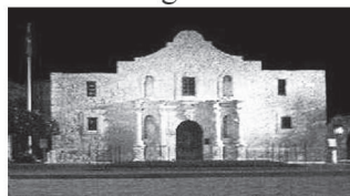
San Antonio de Valero

The five missions were: San Antonio de Valero established in 1718 as a way station between Mexico and the original East Texas missions. It was already over 100 years old when it came to fame as The Alamo....five miles downstream was Mission San Jose, founded in 1720 and which provided the strongest garrison against Indian raids... San Juan Capistrano the agricultural center for the missions, in 1762 reporting 3500 head of sheep and nearly as many cattle on it's ranch a few miles southeast....Concepcion, from 1731 the attractive center of religious activities with architecture featuring towers and colorful geometric designs...Espada prior to 1731 was near Nacodoches as San Francisco de los Tejas, now the southernmost mission along the San Antonio river.