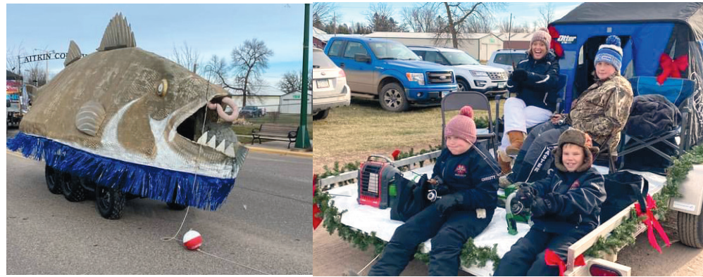
Mille Lacs Energy two-part entry landed as a winner in the Fish House Parade float contest.