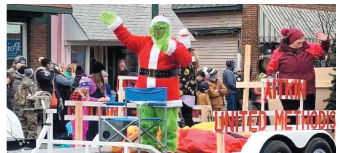
The Grinch was spotted on the United Methodist float in Aitkin's Fish House Parade on Nov. 26.

The Land Services Department is committed to providing excellent customer service while helping residents and our local businesses make wise choices that protect Crow Wing County's extraordinary natural resources. Citizens are encouraged to contact Land Services at (218) 824-1010 or land.services@crowwing.us to discuss hazardous waste, solid waste, demolition material composting, or recycling activities.