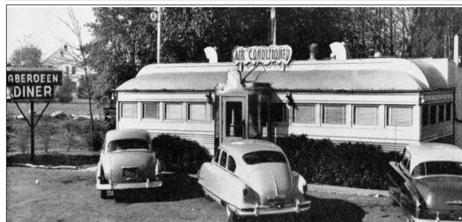
The Aberdeen Diner c1940s to 60s