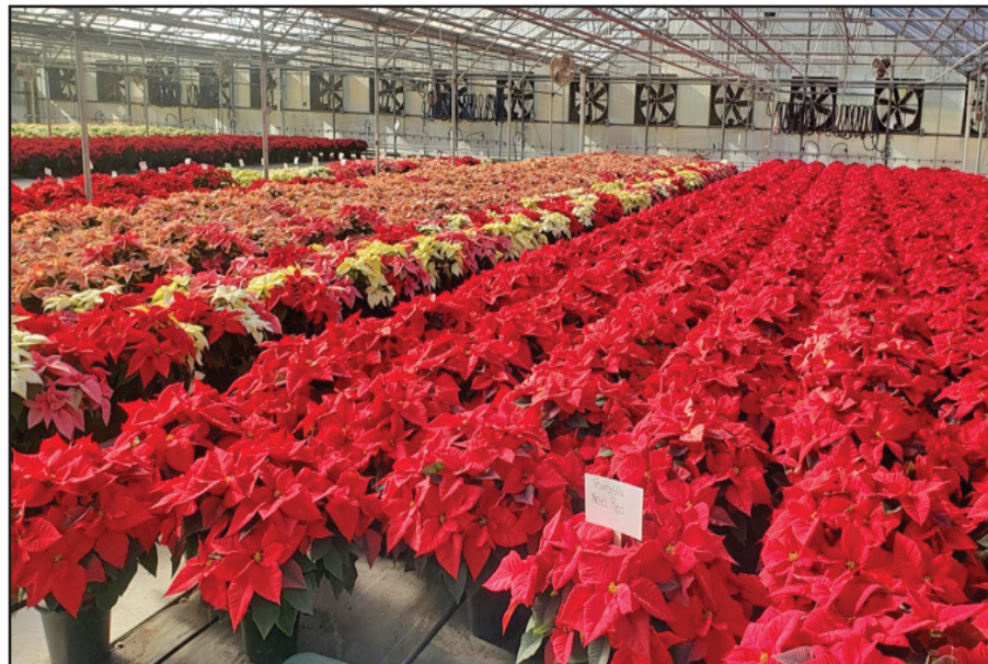
A tropical plant native to Mexico, the poinsettia was brought to the United States in 1825 by Joel Roberts Poinsett. Since that time, the poinsettia has become one of the most popular holiday plants. (Above) A variety of poinsettias in a Bell Nursery.

Pick a healthy plant. The longevity of a poinsettia plant can be dependent