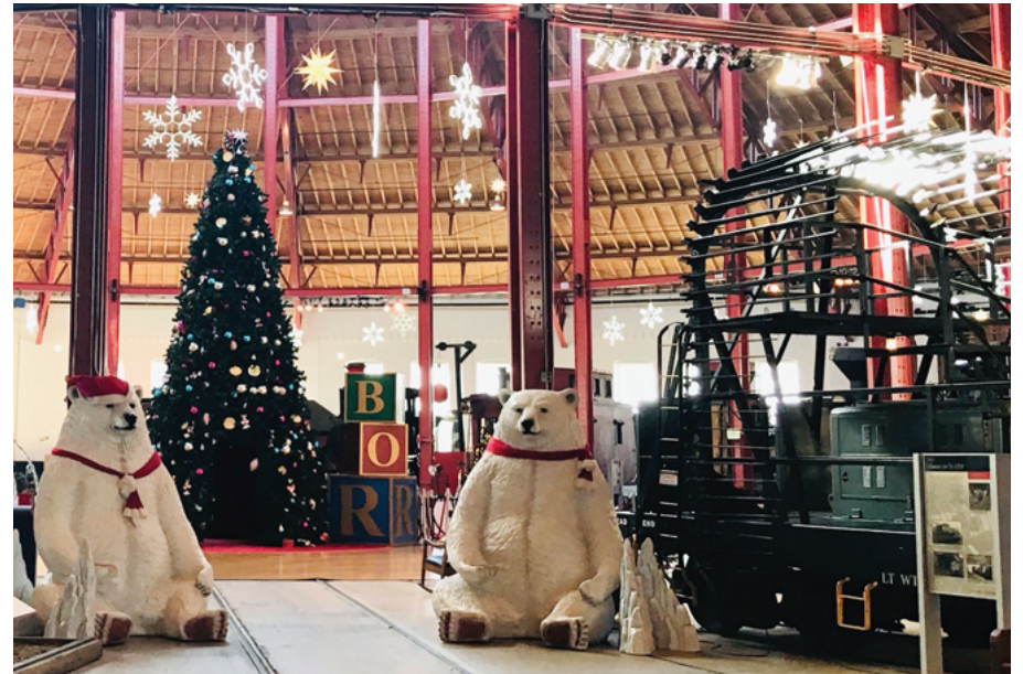
B&O Railroad Museum has been transformed into a winter wonderland for the holiday season.

In addition to the new exhibition, the Museum has been transformed into a winter wonderland of holiday fun and