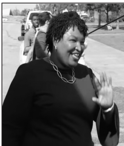
Stacey Abrams declared as a candidate for the 2022 Georgia Gubernatorial race in 2022

"I'm running because opportunity in our state shouldn't be determined by zip code, background, or access to power," Abrams declared. "That's the job of the