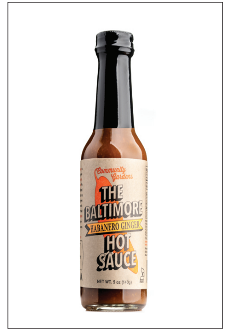
The Baltimore Habanero Ginger Hot Sauce.

“We’re a small company,” said the 31-year-old. “The name of our company, Small Axe comes from an old proverb that talks about if you are a big tree, we