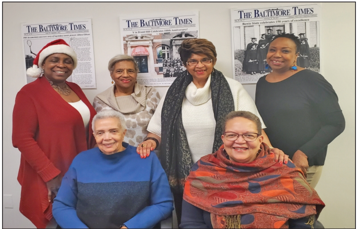
The Baltimore Times Staff wishes you Merry Christmas & Happy New Year

Yet, despite the predominantly adverse stories that make the national and local news, The Baltimore Times is encouraged by local non-profits, banks and corporate community partners that do their part to improvement “he community; the “kidpreneurs” who start a company to help those less fortunate; the stories of overcoming financial adversity to start a successful business after years of struggle; and corporate businesses that believe community investment and reinvestment is for the betterment of their business and the community they serve.